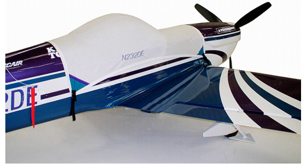
Cap 232 Canopy Cover