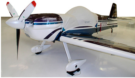
Cap 232 Canopy Cover