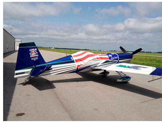
Extra 300SC Canopy Cover with custom artwork