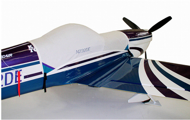
Cap 232 Canopy Cover