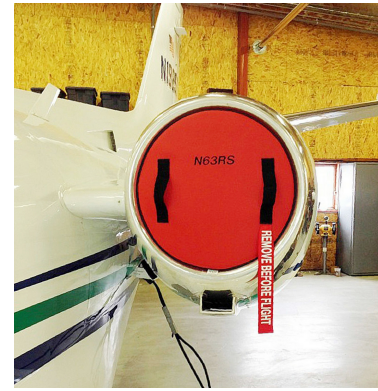
Cessna Citation S2 Intake Plugs