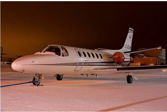
Cessna Citation 550 Engine Cover Set