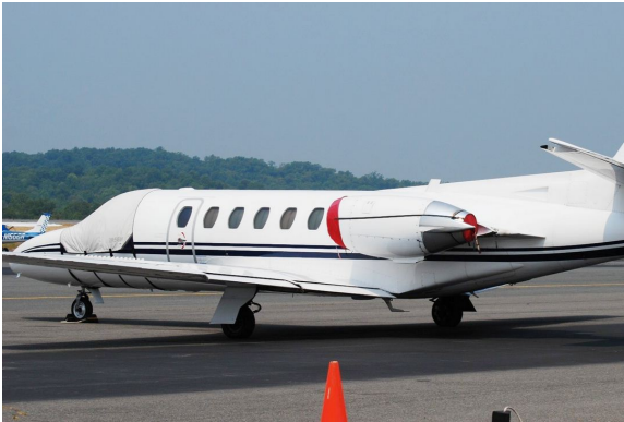
Cessna Citation S2 Cockpit Cover, Intake Covers & Exhaust Plugs