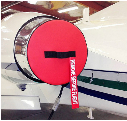
Cessna Citation S2 Exhaust Plugs