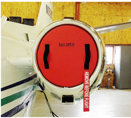
Cessna Citation S-550 Intake Plugs