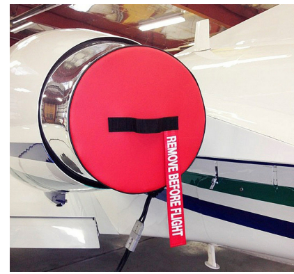
Cessna Citation S2 Exhaust Plugs