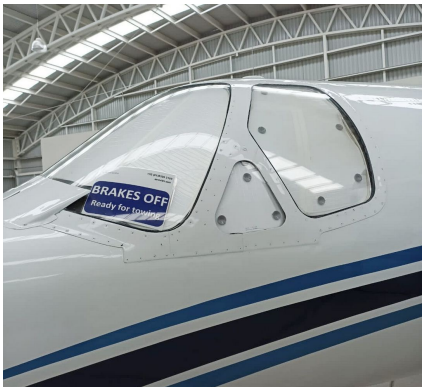
Cessna Citation I & II Cockpit HeatShields

Custom-made Heatshield Sunshades are available for almost any window in the jet. Side windows, Skylights, and Emergency Exits are all custom-made. The product is a unique composite of closed-cell foam with a silver mylar finish. The set is easily stored in the included storage sleeve. Some designs may require velcro and suction cups. Our Heatshields are offered white side out since aircraft manufacturers have issued advisories against reflective window inserts due to potential heat damage.