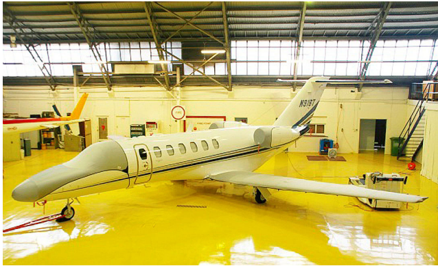
Cessna Citationjet CJ3 Cockpit/Nose, Engine & Wings Travel Covers

WINTER USE MATERIAL - Made with Solution-Dyed Polyester fabric, this option is intended for seasonal use to aid in deicing, rain mitigation, or for occasional travel. The material is lighter and more compact, but more susceptible to UV damage and may have a shorter useful life if used continuously outside than the all-year use material.