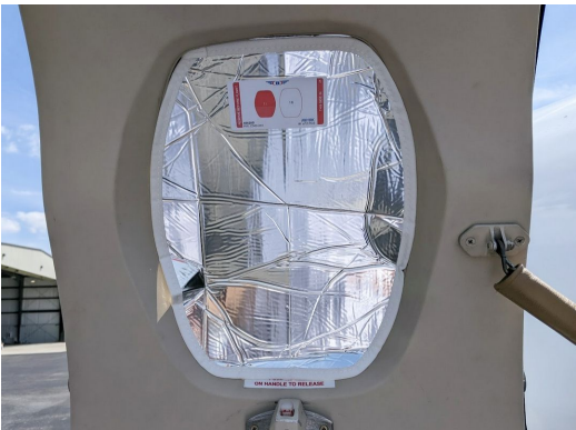
Citationjet Entrance Door Heatshield