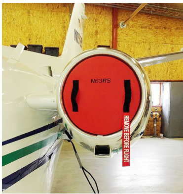
Cessna Citation S2 Intake Plugs