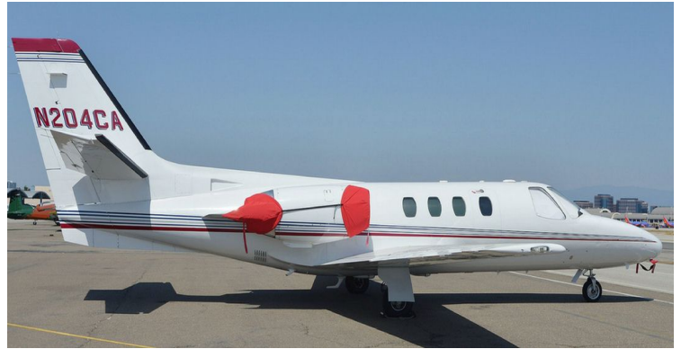
Cessna Citation Engine Covers and Heatshields