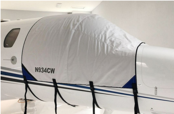
Cessna Citation M2 Cockpit Cover

This cover type is made from Silver Acrylic Sunbrella canvas and is 100% lined with a soft and smooth microfiber. Bruce's Custom Covers developed this material combination especially for aircraft protection. The outer material is medium weight and treated for water resistance, UV resistance and anti-static buildup. The inner lining is a very soft and smooth microfiber to prevent scratching. The material is very reflective, and tests show that the cabin interior temperature can be reduced to near-ambient temperature on the hottest of days. It is water, ice and snow repellent, yet breathable to allow moisture to escape from between the cover and the aircraft surface.