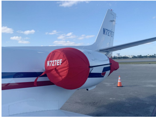
Cessna Citation S550

and dried if necessary. Engine plugs have 'remove before flight' streamers sewn onto the face of the plugs. Most plugs are imprinted with the aircraft registration number in black. Engine plugs may be inserted after flight when the engine is still warm. Engine Inlet Plugs are commonly referred to as Cowl Plugs, Intake Plugs, Cowl Blocks, Engine Blocks, and Engine Bungs.