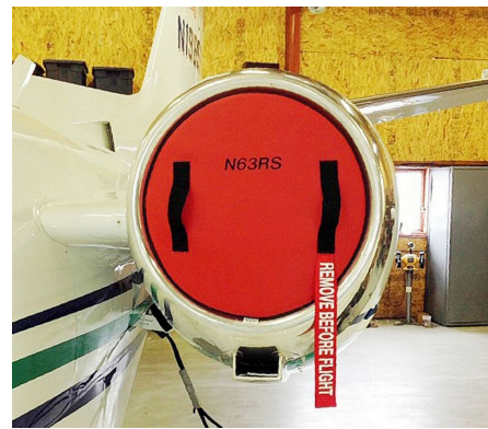
Cessna Citation S-550 Intake Plugs