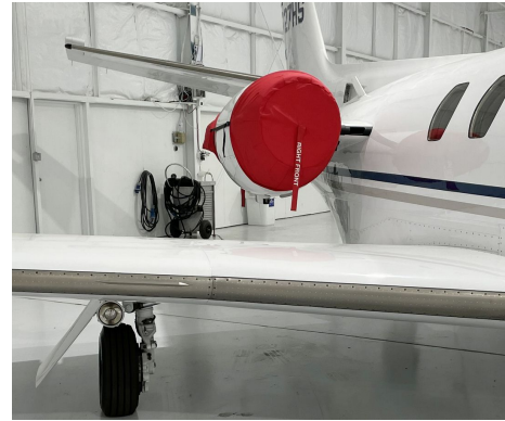
Cessna Citation S550 Intake/Exhaust Covers