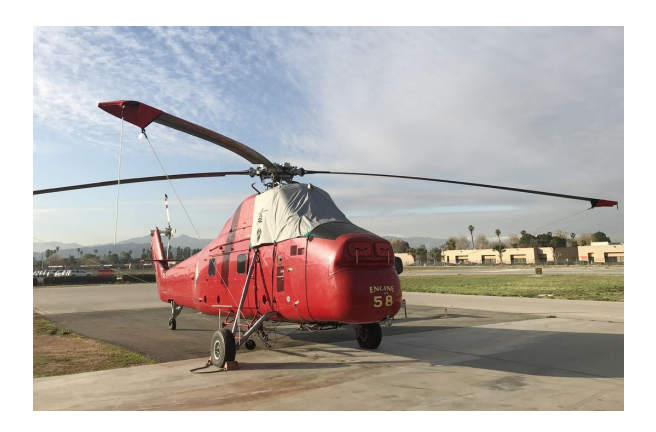
Sikorsky S58T Travel Cockpit Cover, Engine Plugs and Blade Tie-Downs