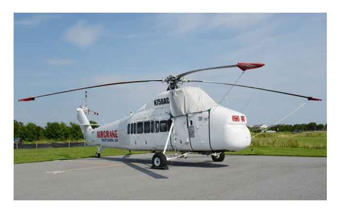
Sikorsky S58T Cockpit Cover, Intake Plugs, Blade Tie-Downs