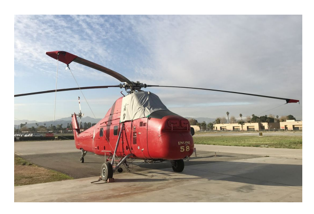
Sikorsky S58T Travel Cockpit Cover, Engine Plugs and Blade Tie-Downs