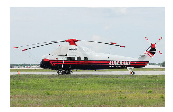
S58 Cockpit Windshield, Main Rotor, Particle Separator, Exhaust Covers, Intake Plugs and Blade Tie-downs

WINTER USE MATERIAL - Made with Solution-Dyed Polyester fabric, this option is intended for seasonal use to aid in deicing, rain mitigation, or for occasional travel. The material is lighter and more compact, but more susceptible to UV damage and may have a shorter useful life if used continuously outside than the all-year use material.