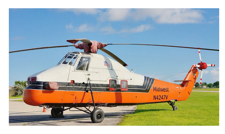
Sikorsky S58T Rotor Hub, Tail Rotor Hub, Engine Plugs, Blade Tie-Downs

The Engine Inlet Plugs are custom fit for your Sikorsky S58T intakes, made with heavy-duty vinyl material, and stuffed with a single block of sculpted urethane foam. Each plug has a zipper that allows the foam to be removed and dried if necessary. Engine plugs have 'Remove Before Flight' streamers sewn onto the face of the plugs. Most plugs are imprinted with the aircraft registration number in black for an extra charge. Storage bag NOT included. Engine plugs may be inserted after flight when the engine is still warm. Engine Inlet Plugs are commonly referred to as Cowl Plugs, Intake Plugs, Cowl Blocks, Engine Blocks, and Engine Bungs.