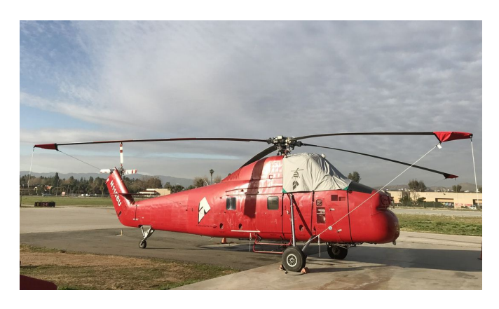
Sikorsky S58T Travel Cockpit Cover and Blade Tie-Downs