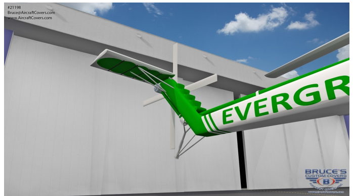
Sikorsky S-64 Skycrane, CH-54 Tarhe Insulated Engine, Rotor Sikorsky S-64 Canopy/Nose, Engine Area, Blade, Rotor, Tail Rotor Hub, Tailboom, Stabilizer & Tail Rotor Covers (illustration)