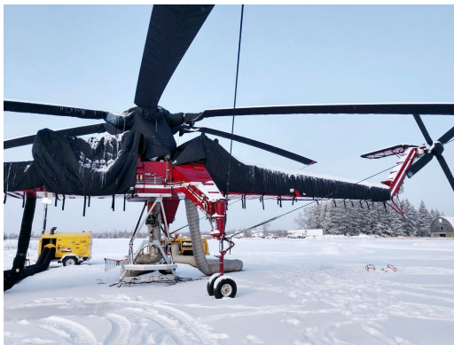
Sikorsky S-64 Skycrane, CH-54 Tarhe Insulated Engine, Rotor Sikorsky S-64 Canopy/Nose, Engine Area, Blade, Rotor, Tail Rotor Hub, Tailboom, Stabilizer & Tail Rotor Covers

The Tailboom Cover details vary by model, but generally the helicopter tail boom cover encloses the tail boom from the "bottleneck" to the aft end. They usually also cover the horizontal stabilizers, and are custom made to allow for antennae, lights, and other protrusions. They attach with straps underneath the tail boom. Covers for the vertical and horizontal stabilizers are also available separately. Specific information for each model is available on request.