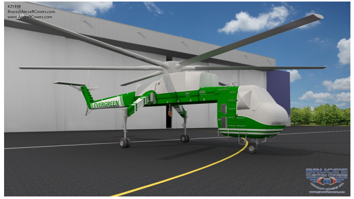
Sikorsky S-64 Skycrane, CH-54 Tarhe Insulated Engine, Rotor Sikorsky S-64 Canopy/Nose, Engine Area, Blade, Rotor, Tail Rotor Hub, Tailboom, Stabilizer & Tail Rotor Covers Sikorsky S-64 Skycrane, CH-54 Tarhe Insulated Engine, Rotor Sikorsky S-64 Canopy/Nose, Engine Area, Blade, Rotor, Tail Rotor Hub, Tailboom, Stabilizer & Tail Rotor Covers (illustration)