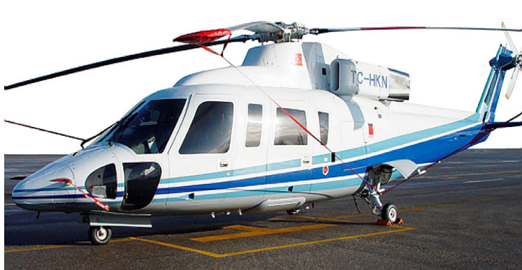
S76 Blade Tie-Downs and Pitot Cover set

WINTER USE MATERIAL - Made with Solution-Dyed Polyester fabric, this option is intended for seasonal use to aid in deicing, rain mitigation, or for occasional travel. The material is lighter and more compact, but more susceptible to UV damage and may have a shorter useful life if used continuously outside than the all-year use material.