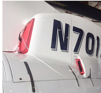
Sikorsky S76 (All Models) Intake Plugs (S76c Models)