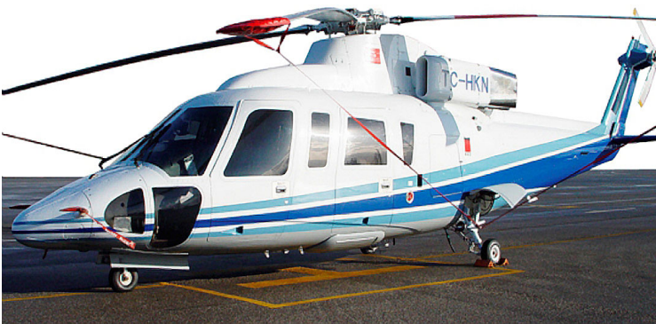
S76 Blade Tie-Downs and Pitot Cover set

WINTER USE MATERIAL - Made with Solution-Dyed Polyester fabric, this option is intended for seasonal use to aid in deicing, rain mitigation, or for occasional travel. The material is lighter and more compact, but more susceptible to UV damage and may have a shorter useful life if used continuously outside than the all-year use material.