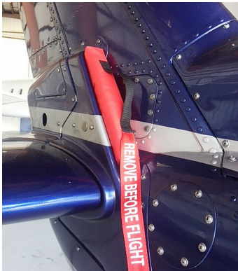
S76 Tail Wedge Plug

The Engine Inlet Plugs are custom fit for your Sikorsky S76 (All Models) intakes, made with heavy-duty vinyl material, and stuffed with a single block of sculpted urethane foam. Each plug has a zipper that allows the foam to be removed and dried if necessary. Engine plugs have 'Remove Before Flight' streamers sewn onto the face of the plugs. Most plugs are imprinted with the aircraft registration number in black for an extra charge. Storage bag NOT included. Engine plugs may be inserted after flight when the engine is still warm. Engine Inlet Plugs are commonly referred to as Cowl Plugs, Intake Plugs, Cowl Blocks, Engine Blocks, and Engine Bungs.