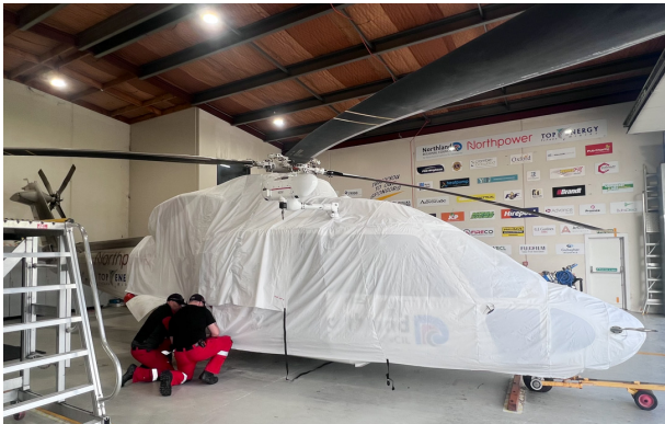
Sikorsky S76C Forward Canopy Cover, Engine Cover (test fit covers)