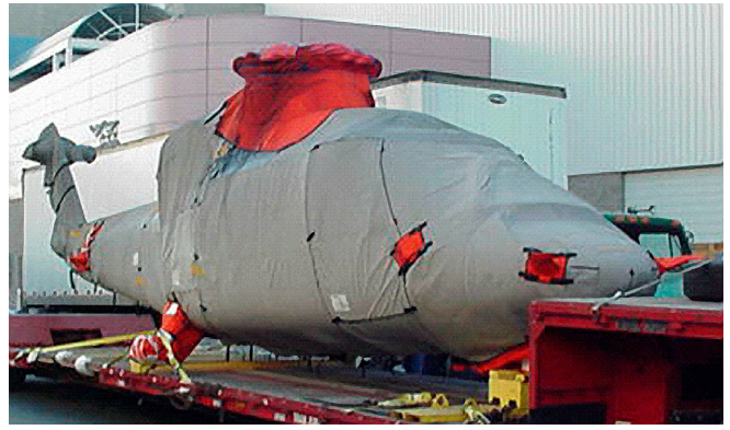
S76 Full Body Transport Cover