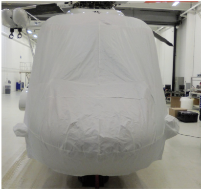
Sikorsky S-92 Windshield/Nose Cover, test fit cover

This cover type is made from Silver Acrylic Sunbrella canvas and is 100% lined with a soft and smooth microfiber. Bruce's Custom Covers developed this material combination especially for aircraft protection. The outer material is medium weight and treated for water resistance, UV resistance and anti-static buildup. The inner lining is a very soft and smooth microfiber to prevent scratching. The material is very reflective, and tests show that the cabin interior temperature can be reduced to near-ambient temperature on the hottest of days. It is water, ice and snow repellent, yet breathable to allow moisture to escape from between the cover and the aircraft surface.