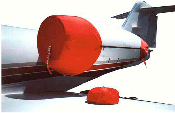
Lear 30 Tri-Fold Engine Cover

The Rockwell Sabre 40, 65, 75, 80 Bikini Style Engine Covers are a single-piece design using a soft and smooth stretchy fabric. The cover stretches tightly over both the intake and exhaust, installing quickly and easily. These covers are designed to be used as hangar dust covers and have a useful life of approximately one year.