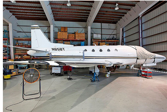
Sabre 40 Cockpit Cover