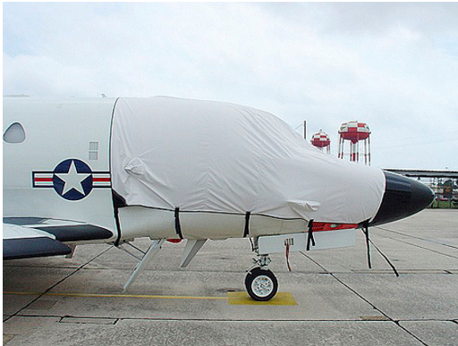
Sabre 40 Cockpit Cover

This cover type is made from Silver Acrylic Sunbrella canvas and is 100% lined with a soft and smooth microfiber. Bruce's Custom Covers developed this material combination especially for aircraft protection. The outer material is medium weight and treated for water resistance, UV resistance and anti-static buildup. The inner lining is a very soft and smooth microfiber to prevent scratching. The material is very reflective, and tests show that the cabin interior temperature can be reduced to near-ambient temperature on the hottest of days. It is water, ice and snow repellent, yet breathable to allow moisture to escape from between the cover and the aircraft surface.