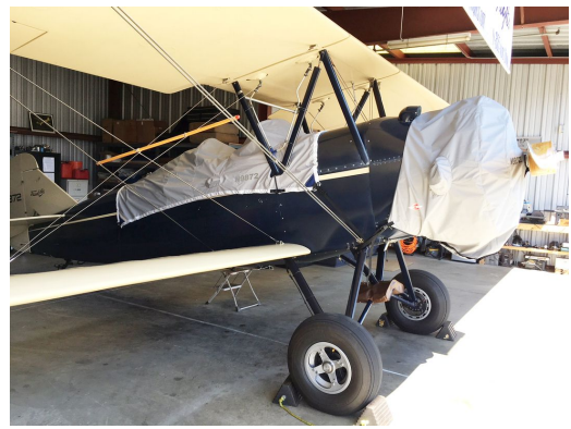
Travel Air 4000 Canopy and Engine Covers, light weight travel type