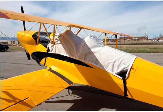
Bucker Jungmann Canopy Cover

the hottest of days. It is water, ice and snow repellent, yet breathable to allow moisture to escape from between the cover and the aircraft surface.