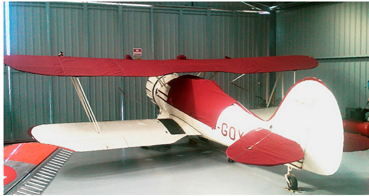
Waco UPF-7 Upper Wing Cover, Horizontal Stabilizer Cover & Canopy Cover

WINTER USE MATERIAL - Made with Solution-Dyed Polyester fabric, this option is intended for seasonal use to aid in deicing, rain mitigation, or for occasional travel. The material is lighter and more compact, but more susceptible to UV damage and may have a shorter useful life if used continuously outside than the all-year use material.