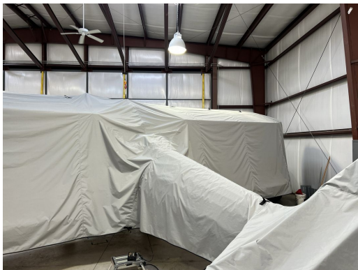
Stearman PT-13 Full Body Dust Cover, Prop Cover Included

Some high value aircraft end up logging lots of hangar time, and become dust magnets in the process. A high quality, well fitting dust cover provides easy assurance that the aircraft's surfaces remain clean and free of grit and grime. Available in a large variety of colors, each dust cover is custom made according to aircraft details and customer preferences. Fire retardant fabrics are also available.