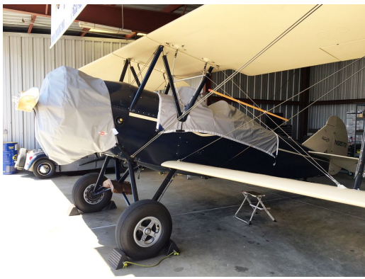
Travel Air 4000 Canopy and Engine Covers, light weight travel type