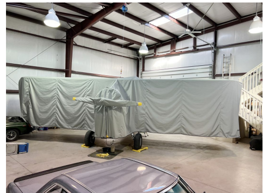
Stearman PT-13 Full Body Dust Cover