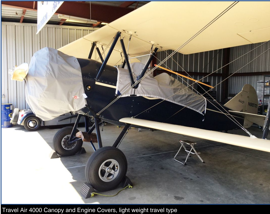
Travel Air 4000 Canopy and Engine Covers, light weight travel type