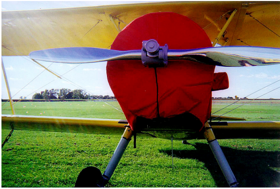
Stearman Engine Cover

the hottest of days. It is water, ice and snow repellent, yet breathable to allow moisture to escape from between the cover and the aircraft surface.