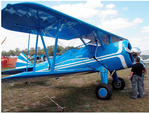
Stearman Canopy Cover (std. color is silver)