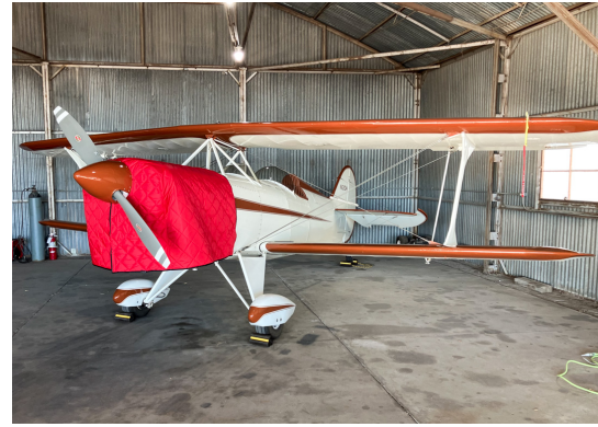
SKYBOLT, Insulated Hangar Blanket, Custom Fit Interior Use)