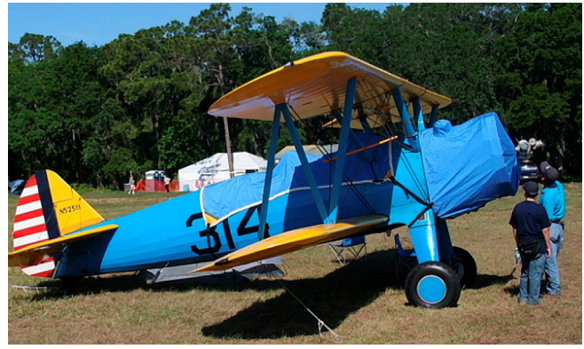
Stearman Canopy & Engine Covers