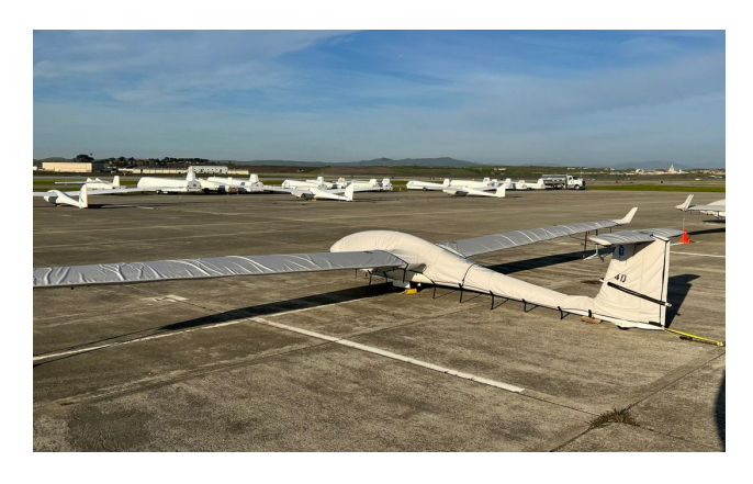
Schempp-Hirth Discus 2B Complete Cover Set