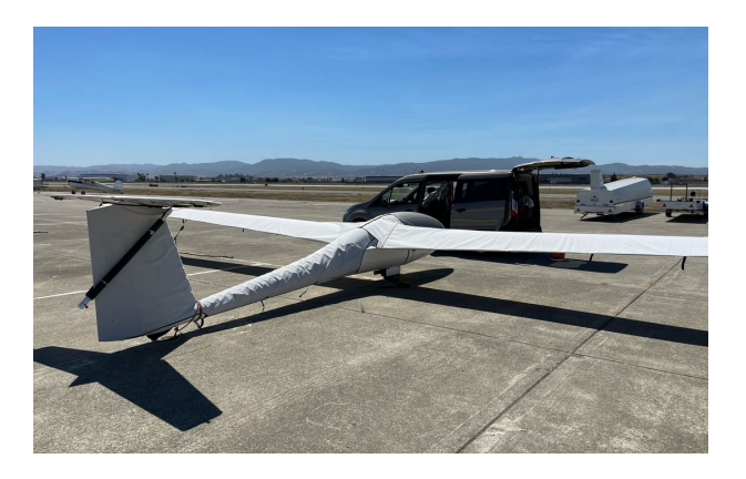
Schempp-Hirth Standard Cirrus Wing & Empennage Covers