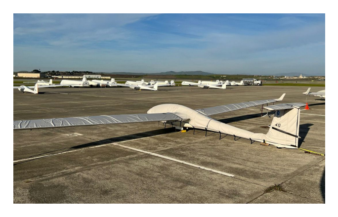
Schempp-Hirth Discus 2B Complete Cover Set