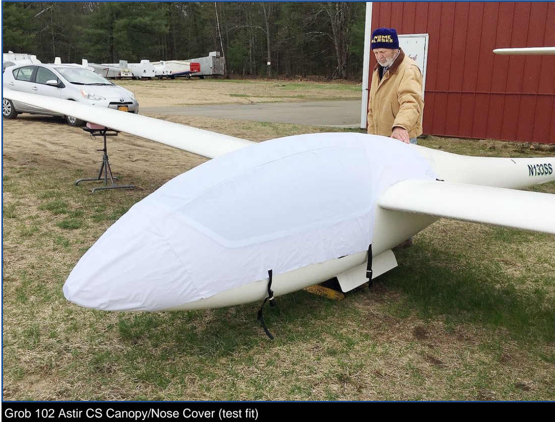
Grob 102 Astir CS Canopy/Nose Cover (test fit)