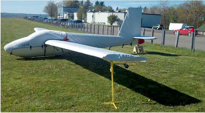
SGS 1-26B Canopy/Nose, Empennage & Wing Covers