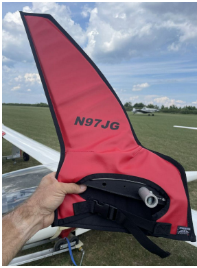
Schempp-Hirth Ventus-2B winglet/wingtip pads