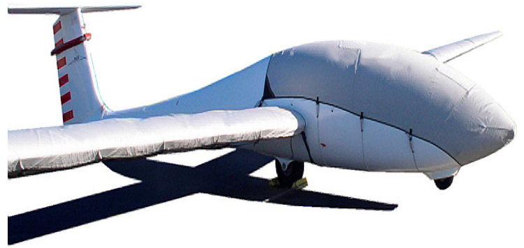
Grob 103 Canopy/Nose Cover and Wing Covers