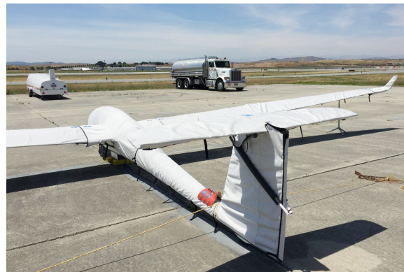
Schempp-Hirth Discus 2B Full Cover Set