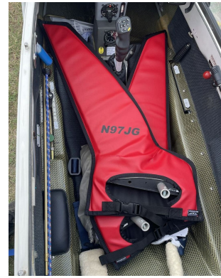
Schempp-Hirth Ventus-2B winglet/wingtip pads