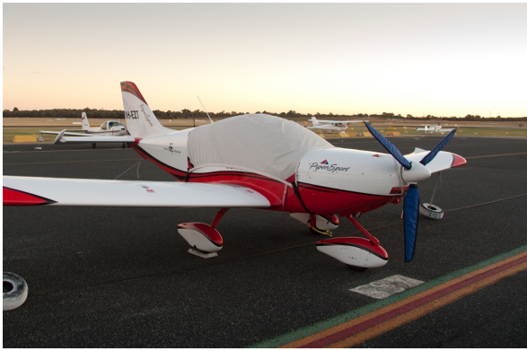
PiperSport Canopy Cover, Engine Plugs