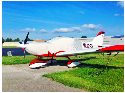
SportCruiser Canopy/Engine Cover