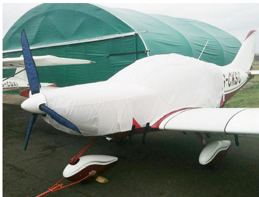
PiperSport Canopy/Engine Cover, Wing Locker Covers

This cover type is made from Silver Acrylic Sunbrella canvas and is 100% lined with a soft and smooth microfiber. Bruce's Custom Covers developed this material combination especially for aircraft protection. The outer material is medium weight and treated for water resistance, UV resistance and anti-static buildup. The inner lining is a very soft and smooth microfiber to prevent scratching. The material is very reflective, and tests show that the cabin interior temperature can be reduced to near-ambient temperature on the hottest of days. It is water, ice and snow repellent, yet breathable to allow moisture to escape from between the cover and the aircraft surface.