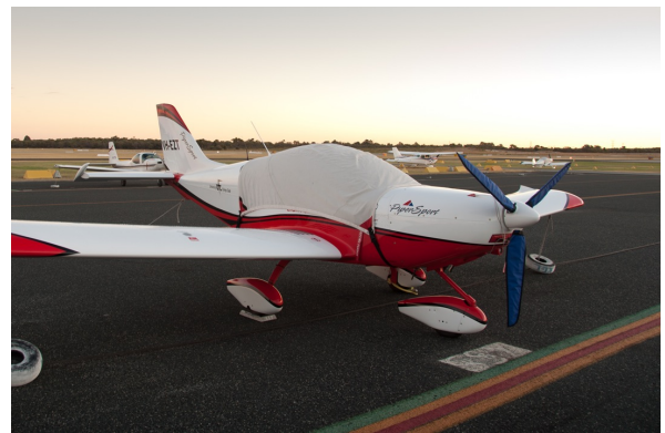
PiperSport Canopy Cover, Engine Plugs