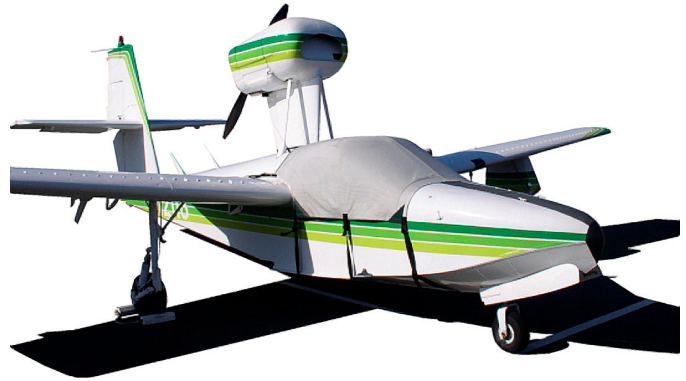
Lake LA-250 Canopy Cover