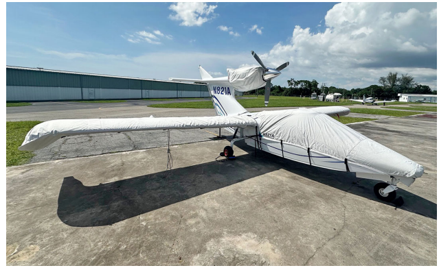
Seawind 3000 Canopy/Nose, Wing & Engine Covers