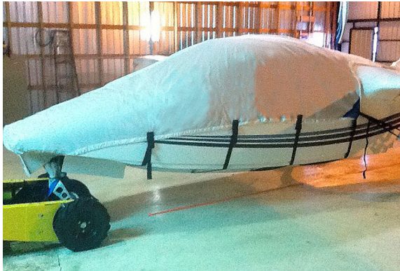
Seawind Canopy/Nose Cover

This cover type is made from Silver Acrylic Sunbrella canvas and is 100% lined with a soft and smooth microfiber. Bruce's Custom Covers developed this material combination especially for aircraft protection. The outer material is medium weight and treated for water resistance, UV resistance and anti-static buildup. The inner lining is a very soft and smooth microfiber to prevent scratching. The material is very reflective, and tests show that the cabin interior temperature can be reduced to near-ambient temperature on the hottest of days. It is water, ice and snow repellent, yet breathable to allow moisture to escape from between the cover and the aircraft surface.