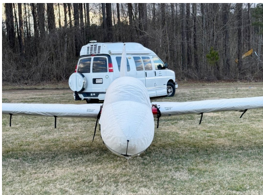
Schweizer SGS 2-32 Complete Cover Set

the hottest of days. It is water, ice and snow repellent, yet breathable to allow moisture to escape from between the cover and the aircraft surface.