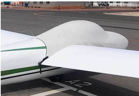
Schweizer 2-32 Canopy/Nose Cover