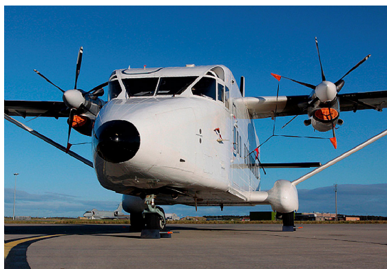
Covers, Plugs & HeatShields for the Short 330/360