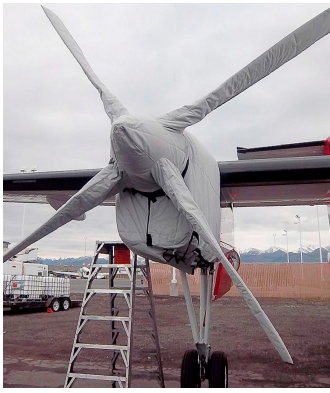
Dash 8 Insulated Engine & Prop Covers