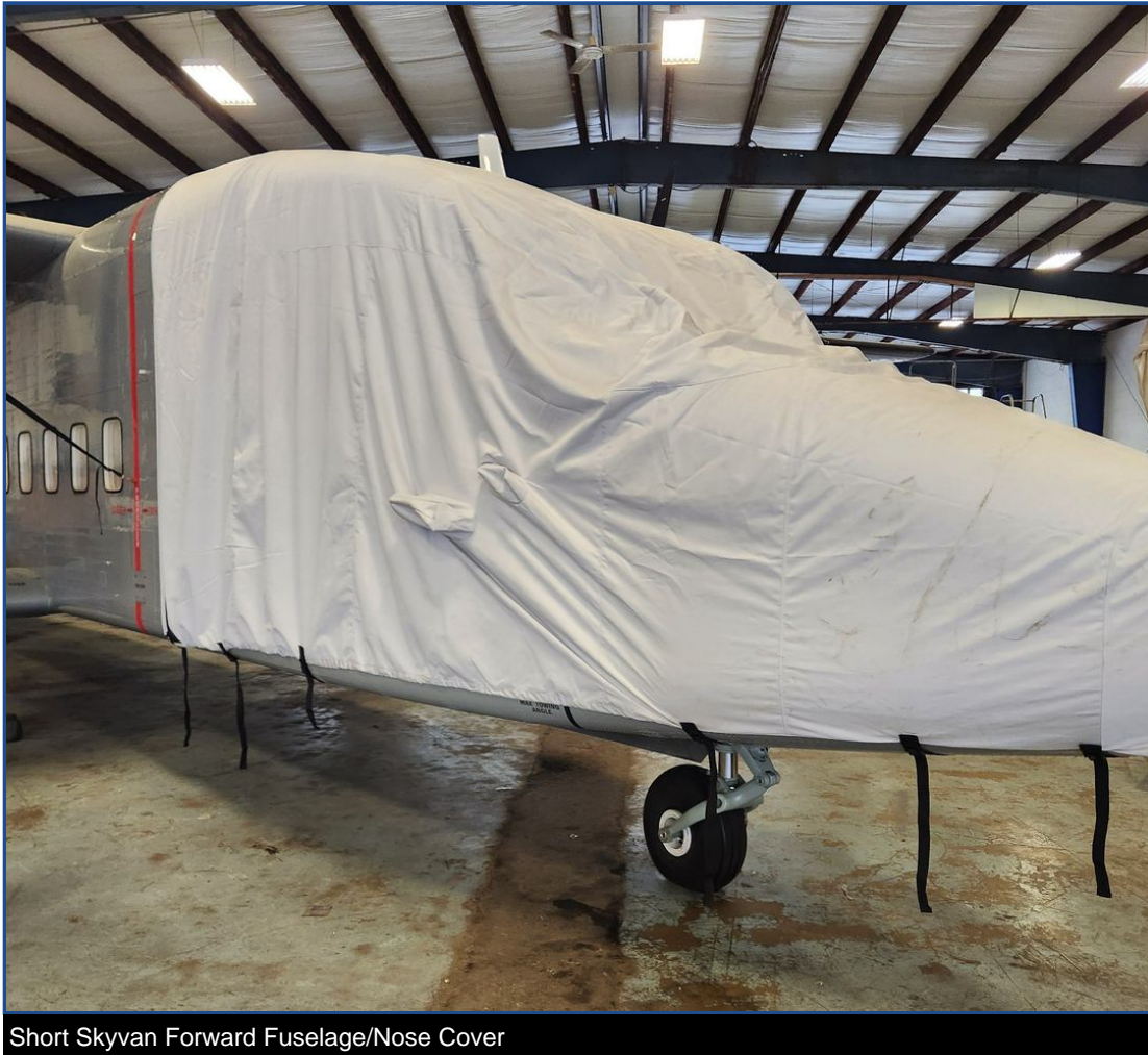
Short Skyvan Forward Fuselage/Nose Cover