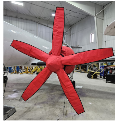
Fairchild Metro 5 Blade Insulated Insulated Prop Covers