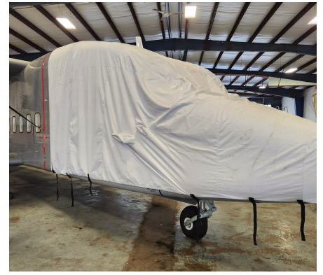
Short Brothers Sherpa, Skyvan, 330 & 360 (C-23) Forward Fuselage/Nose Cover Short Skyvan Forward Fuselage/Nose Cover