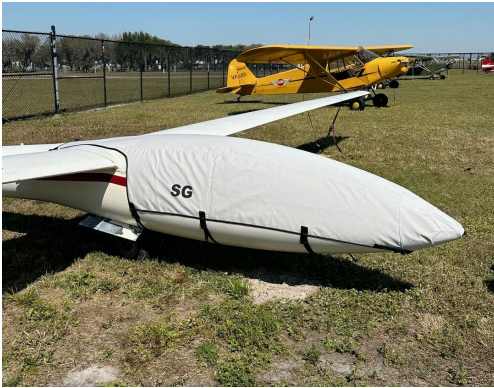
Schreder HP-18 Canopy/Nose Cover

The material is very reflective, and tests show that the cabin interior temperature can be reduced to near-ambient temperature on the hottest of days. It is water, ice and snow repellent, yet breathable to allow moisture to escape from between the cover and the aircraft surface.