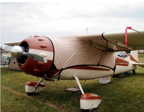
Cessna 195 Canopy Cover, extended forward and over gas caps Cessna 195 Canopy Cover, extended forward and over gas caps