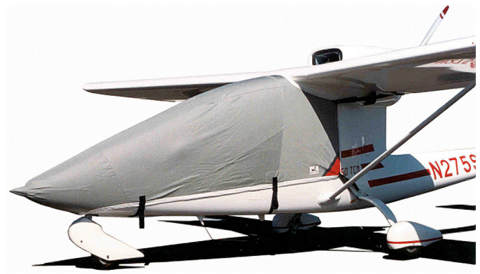
Sky Arrow Standard Canopy Cover