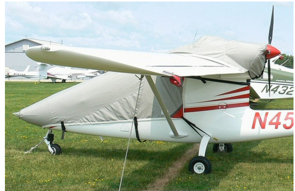
Sky Arrow Canopy/Nose & Engine Covers