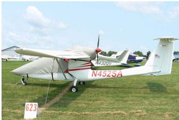
Sky Arrow Canopy & Engine Covers

This cover type is made from Silver Acrylic Sunbrella canvas and is 100% lined with a soft and smooth microfiber. Bruce's Custom Covers developed this material combination especially for aircraft protection. The outer material is medium weight and treated for water resistance, UV resistance and anti-static buildup. The inner lining is a very soft and smooth microfiber to prevent scratching. The material is very reflective, and tests show that the cabin interior temperature can be reduced to near-ambient temperature on the hottest of days. It is water, ice and snow repellent, yet breathable to allow moisture to escape from between the cover and the aircraft surface.