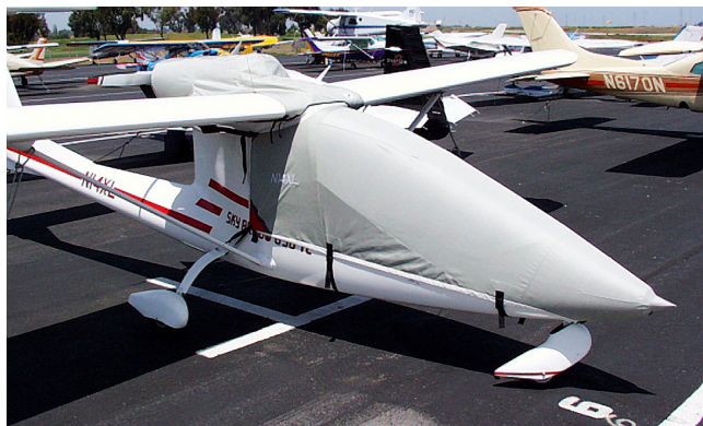
Sky Arrow Canopy & Engine Covers

This cover type is made from Silver Acrylic Sunbrella canvas and is 100% lined with a soft and smooth microfiber. Bruce's Custom Covers developed this material combination especially for aircraft protection. The outer material is medium weight and treated for water resistance, UV resistance and anti-static buildup. The inner lining is a very soft and smooth microfiber to prevent scratching. The material is very reflective, and tests show that the cabin interior temperature can be reduced to near-ambient temperature on the hottest of days. It is water, ice and snow repellent, yet breathable to allow moisture to escape from between the cover and the aircraft surface.