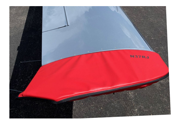
Cirrus SR-22 Wingtip Pads

Designed to prevent damage to the aircraft extremities in crowded hangars, these products are made of bright red Naugahyde and thickly padded with a sandwich of closed cell foam.