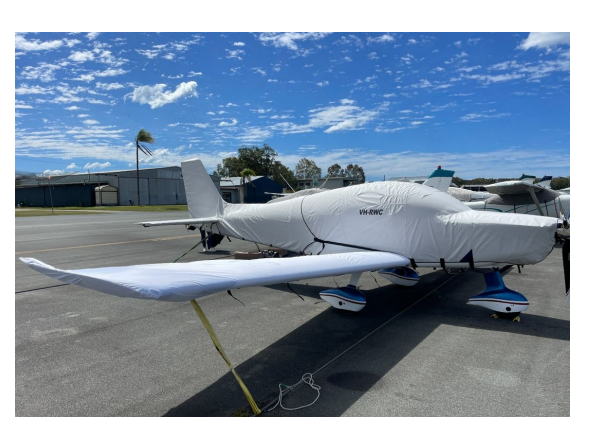
Sling 4 TSi Complete Cover Set