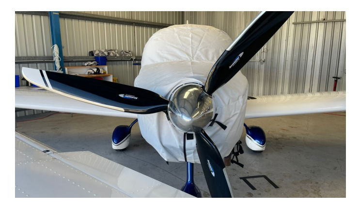
Sling TSI Extended Canopy/Engine Cover