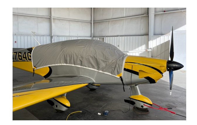
Sling TSI Travel Weight Canopy Cover