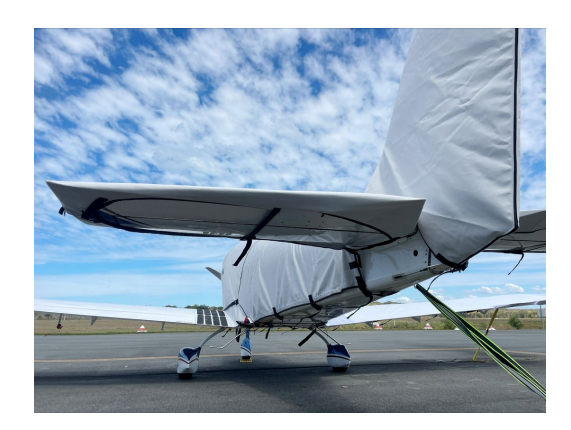
Sling 4 TSi Empennage Cover

WINTER USE MATERIAL - Made with Solution-Dyed Polyester fabric, this option is intended for seasonal use to aid in deicing, rain mitigation, or for occasional travel. The material is lighter and more compact, but more susceptible to UV damage and may have a shorter useful life if used continuously outside than the all-year use material.