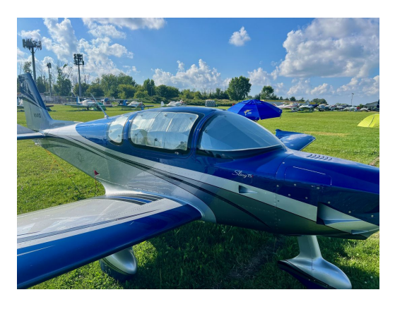
Airplane Factory Sling TSi HeatShield Set