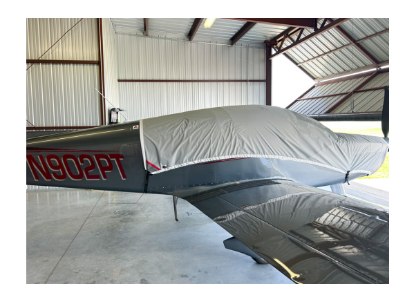
Sling TSI Travel Cover, Light Weight Canopy/Engine Cover

Travel Covers are made with Silver Solution-Dyed Polyester fabric and only lined over the windshield to save weight. The material is lightweight and more compact for easy stowage in the aircraft. The polyester material is water resistant, but only intended for occasional use outside. We also have an ultra lightweight material available for fitted hangar dust covers. For daily outdoor use, the non-travel Sunbrella Cover is the best choice.