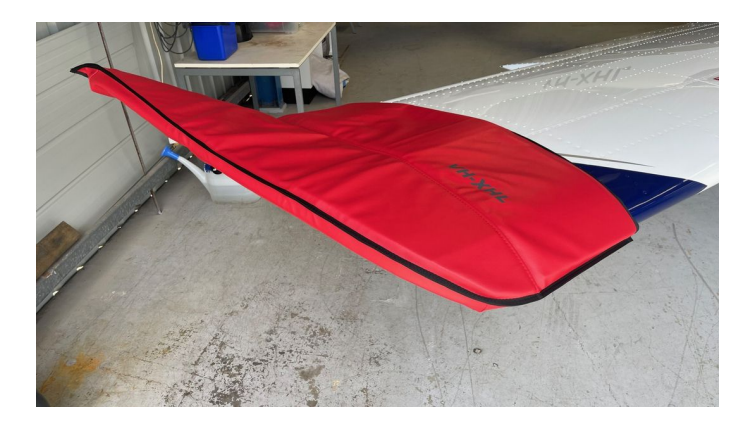
Sling TSI Wingtip Pads