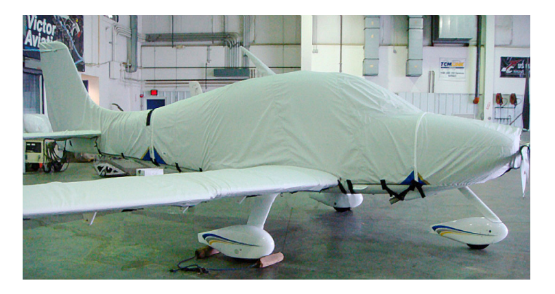
Cirrus SR20 Full Cover Set (Extended Canopy Cover, Engine Cover, Wing Covers, Empennage Cover)