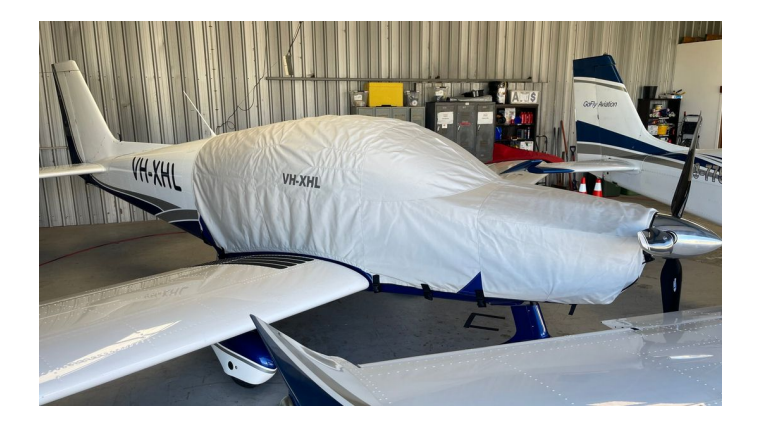
Sling TSI Extended Canopy/Engine Cover

This cover type is made from Silver Acrylic Sunbrella canvas and is 100% lined with a soft and smooth microfiber. Bruce's Custom Covers developed this material combination especially for aircraft protection. The outer material is medium weight and treated for water resistance, UV resistance and anti-static buildup. The inner lining is a very soft and smooth microfiber to prevent scratching. The material is very reflective, and tests show that the cabin interior temperature can be reduced to near-ambient temperature on the hottest of days. It is water, ice and snow repellent, yet breathable to allow moisture to escape from between the cover and the aircraft surface.