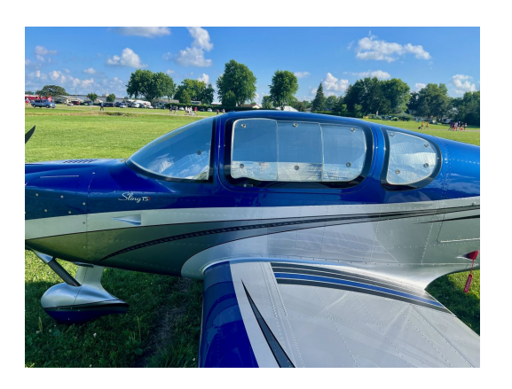
Airplane Factory Sling TSi HeatShield Set