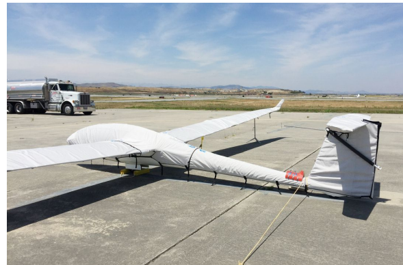
Schemp-Hirth Discus 2B Full Cover Set