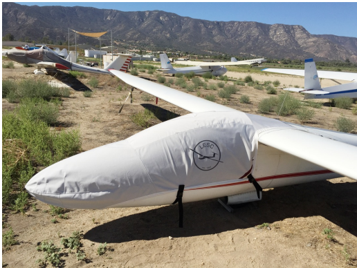
Pilatus B4 Canopy/Nose Cover