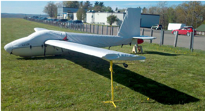
SGS 1-26B Canopy/Nose, Empennage & Wing Covers