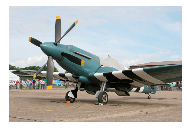
Supermarine Spitfire XIX Canopy Cover

Travel Covers are made with Silver Solution-Dyed Polyester fabric and only lined over the windshield to save weight. The material is lightweight and more compact for easy stowage in the aircraft. The polyester material is water resistant, but only intended for occasional use outside. We also have an ultra lightweight material available for fitted hangar dust covers. For daily outdoor use, the non-travel Sunbrella Cover is the best choice.