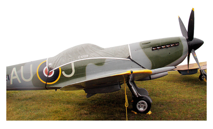
Supermarine Spitfire Mark 16 Canopy Cover