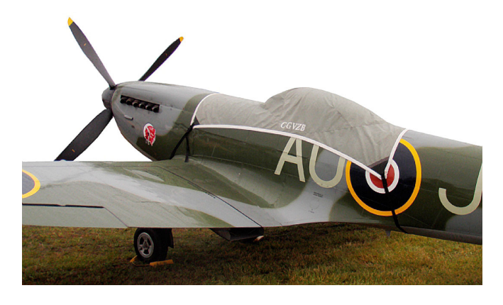
Supermarine Spitfire Mark 16 Canopy Cover