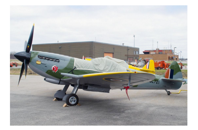
Supermarine Spitfire Mk 14 Canopy Cover