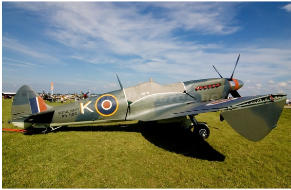
Supermarine Spitfire Mk IX Canopy Cover