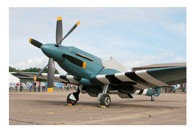
Supermarine Spitfire XIX Canopy Cover