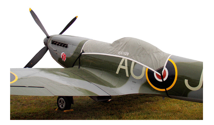
Supermarine Spitfire Mark 16 Canopy Cover

Travel Covers are made with Silver Solution-Dyed Polyester fabric and only lined over the windshield to save weight. The material is lightweight and more compact for easy stowage in the aircraft. The polyester material is water resistant, but only intended for occasional use outside. We also have an ultra lightweight material available for fitted hangar dust covers. For daily outdoor use, the non-travel Sunbrella Cover is the best choice.