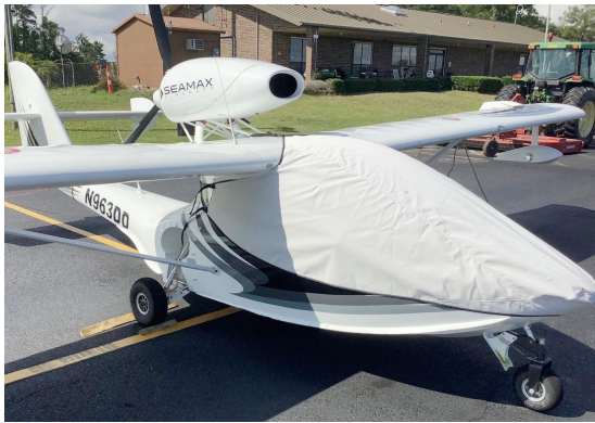
Seamax Canopy/Nose Cover

The material is very reflective, and tests show that the cabin interior temperature can be reduced to near-ambient temperature on the hottest of days. It is water, ice and snow repellent, yet breathable to allow moisture to escape from between the cover and the aircraft surface.