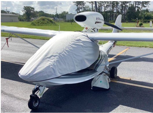
Seamax Canopy/Nose Cover