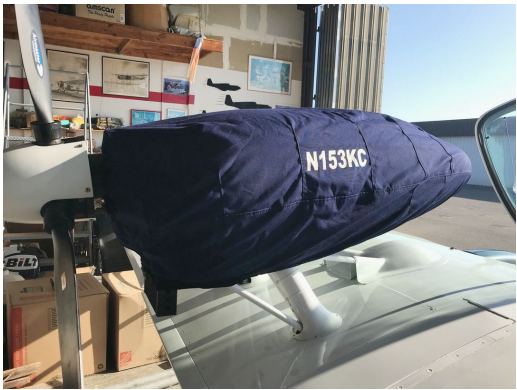
Seamax M22 Engine Cover

Engine Covers will cinch around or behind the spinner, cover the entire engine cowl area including the engine air cooling and induction air inlets, and fastens together with Velcro beneath the spinner down the front of the cowling. The Engine Cover is attached with a belly strap aft of the firewall, and can Velcro to the Canopy Cover. Engine Covers are normally made from Solution-Dyed Polyester or Acrylic Sunbrella . An Insulated version of the engine cover can be made with a thicker, quilted, and water-repellent material. The Insulated Engine Cover works well in cold climates to help with engine preheating.