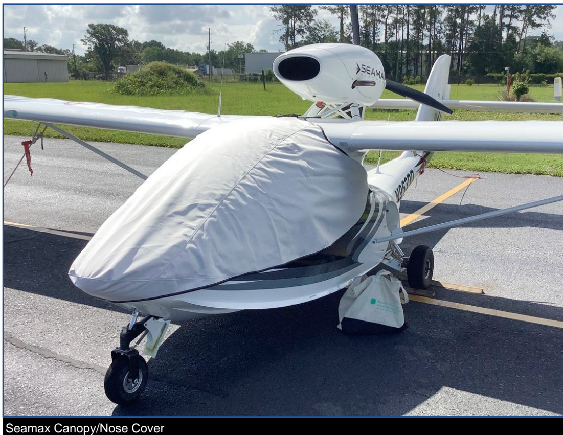
Seamax Canopy/Nose Cover