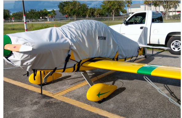
Sonerai Racer Extended Canopy Cover