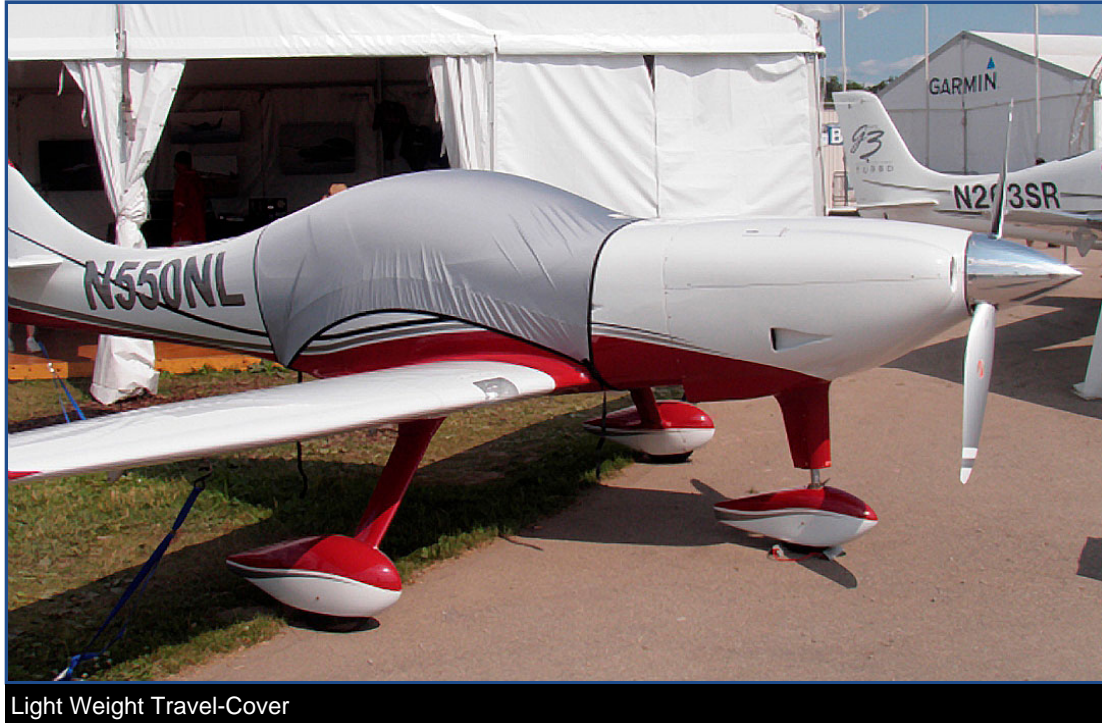
Light Weight Travel-Cover