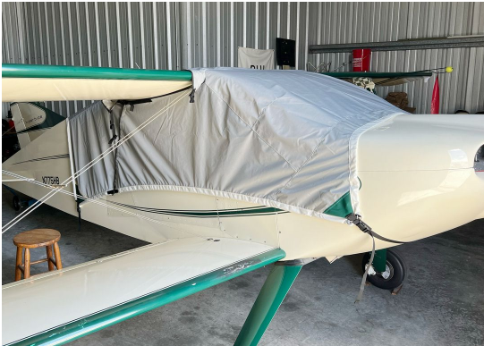
Sorrell SNS-7 Hiperbipe Over The Top Travel Canopy Cover

Travel Covers are made with Silver Solution-Dyed Polyester fabric and only lined over the windshield to save weight. The material is lightweight and more compact for easy stowage in the aircraft. The polyester material is water resistant, but only intended for occasional use outside. We also have an ultra lightweight material available for fitted hangar dust covers. For daily outdoor use, the non-travel Sunbrella Cover is the best choice.