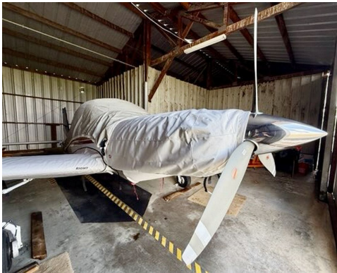
Micco SP20 Engine Cover