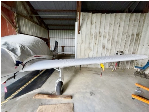
Micco SP20 Wing Covers, All Year Use