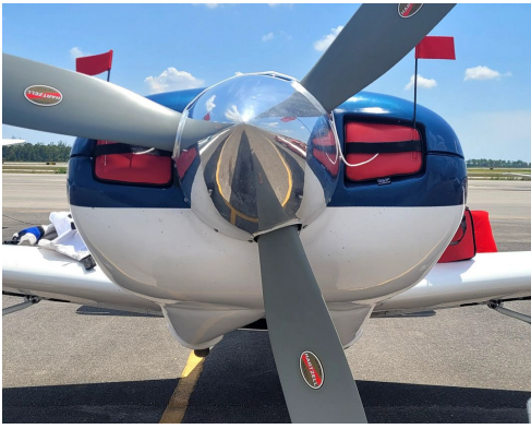
Micco SP20 Engine Inlet Plugs