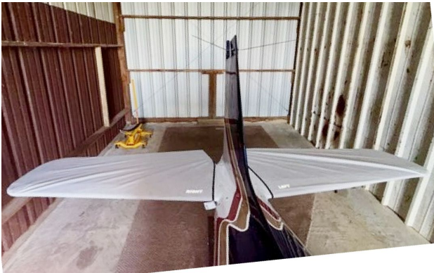
Micco SP20 Horizontal Stabilizer Covers