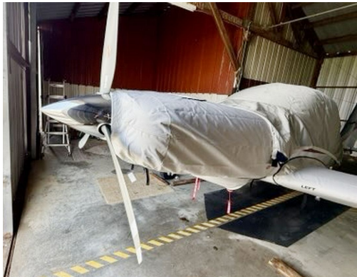
Micco SP20 Engine Cover

This cover type is made from Silver Acrylic Sunbrella canvas and is 100% lined with a soft and smooth microfiber. Bruce's Custom Covers developed this material combination especially for aircraft protection. The outer material is medium weight and treated for water resistance, UV resistance and anti-static buildup. The inner lining is a very soft and smooth microfiber to prevent scratching. The material is very reflective, and tests show that the cabin interior temperature can be reduced to near-ambient temperature on the hottest of days. It is water, ice and snow repellent, yet breathable to allow moisture to escape from between the cover and the aircraft surface.