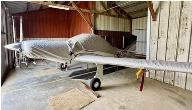
Micco SP20 Wing and Engine Covers

shorter useful life if used continuously outside than the all-year use material.