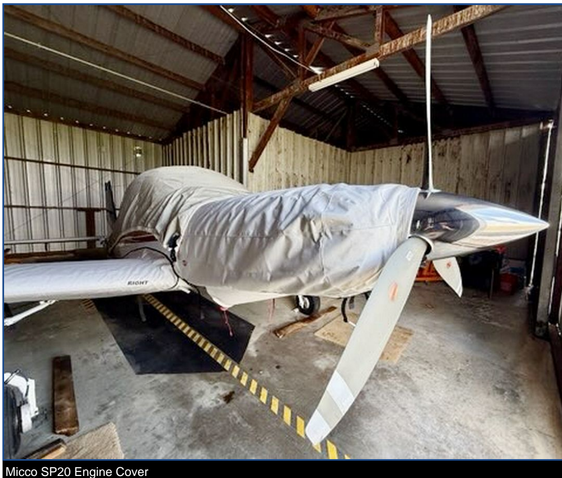
Micco SP20 Engine Cover