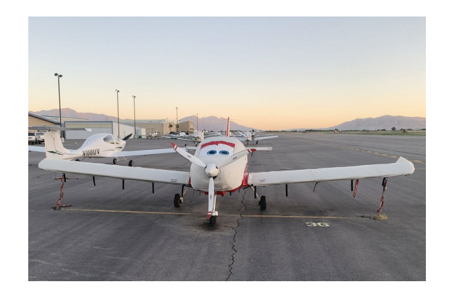
SportCruiser Canopy/Engine & Wing Covers