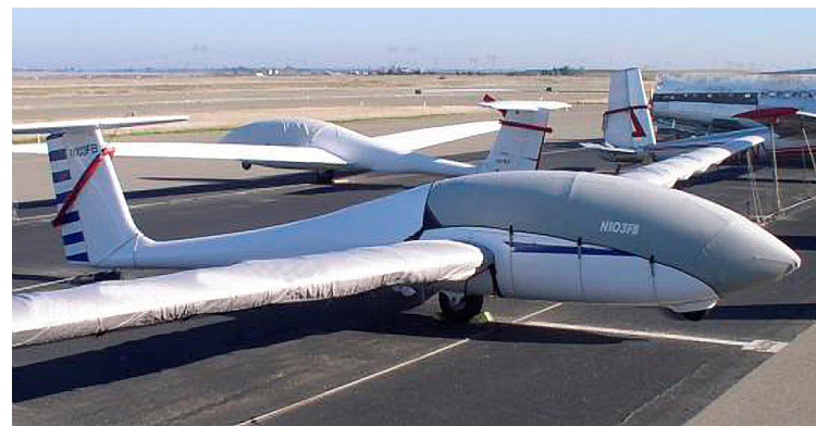
Grob 103 Canopy/Nose & Wing Covers

This cover type is made from Silver Acrylic Sunbrella canvas and is 100% lined with a soft and smooth microfiber. Bruce's Custom Covers developed this material combination especially for aircraft protection. The outer material is medium weight and treated for water resistance, UV resistance and anti-static buildup. The inner lining is a very soft and smooth microfiber to prevent scratching. The material is very reflective, and tests show that the cabin interior temperature can be reduced to near-ambient temperature on the hottest of days. It is water, ice and snow repellent, yet breathable to allow moisture to escape from between the cover and the aircraft surface.