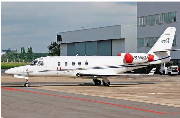
IAI-1125A Astra SPX Engine Cover set

The Israel Aircraft Industries Astra SPX Bikini Style Engine Covers are a single-piece design using a soft and smooth stretchy and fabric. The cover stretches tightly over both the intake and exhaust, installing quickly and easily. These covers are designed to be used as hangar dust covers and have a useful life of approximately one year.