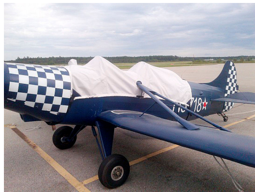
Spezio Tuholer Canopy Cover

The Spezio Tuholer Canopy/Engine Cover is a one-piece cover (100% lined with microfiber) that is a combination of the Canopy Cover and Engine Cover. This cover will enclose the engine cowl and will extend aft to cover all of the windows. This cover type is made from Silver Acrylic Sunbrella canvas and is 100% lined with a soft and smooth microfiber. Bruce's Custom Covers developed this material combination especially for aircraft protection. The outer material is medium weight and treated for water resistance, UV resistance and anti-static buildup. The inner lining is a very soft and smooth microfiber to prevent scratching. The material is very reflective, and tests show that the cabin interior temperature can be reduced to near-ambient temperature on the hottest of days. It is water, ice and snow repellent, yet breathable to allow moisture to escape from between the cover and the aircraft surface.