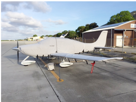
Cirrus SR-22 Full Cover Set

WINTER USE MATERIAL - Made with Solution-Dyed Polyester fabric, this option is intended for seasonal use to aid in deicing, rain mitigation, or for occasional travel. The material is lighter and more compact, but more susceptible to UV damage and may have a shorter useful life if used continuously outside than the all-year use material.