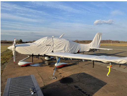
Cirrus SR-22 Complete Cover Set