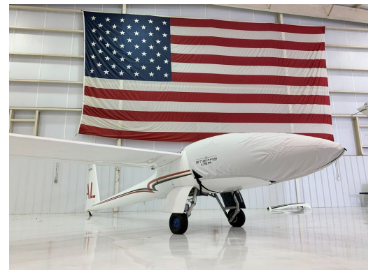
Stemme S-12 Canopy/Nose Cover