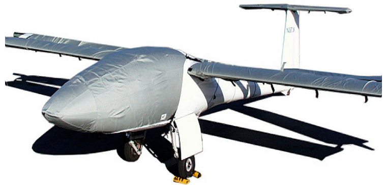
Stemme S-10 Wing Covers & Horiz. Stab. Covers