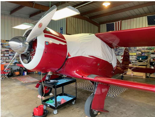
Beech Staggerwing D17S Canopy Cover