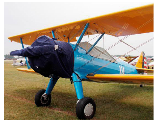
Stearman PT-13 Engine Cover