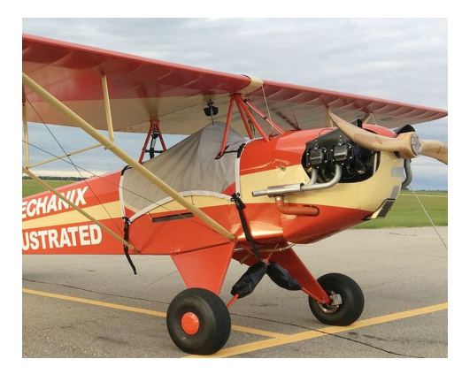
Corben Baby Ace Cockpit Cover