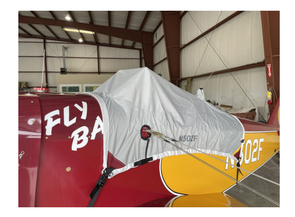
Bowers Fly Baby Canopy Cover