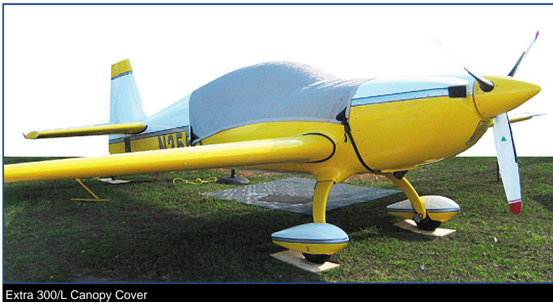
Extra 300/L Canopy Cover