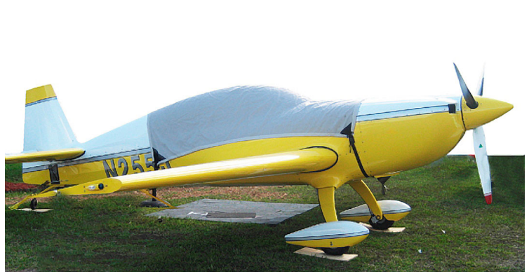
Xtremeair Canopy Cover