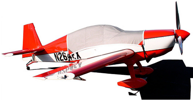
Canopy Cover for the Extra 300