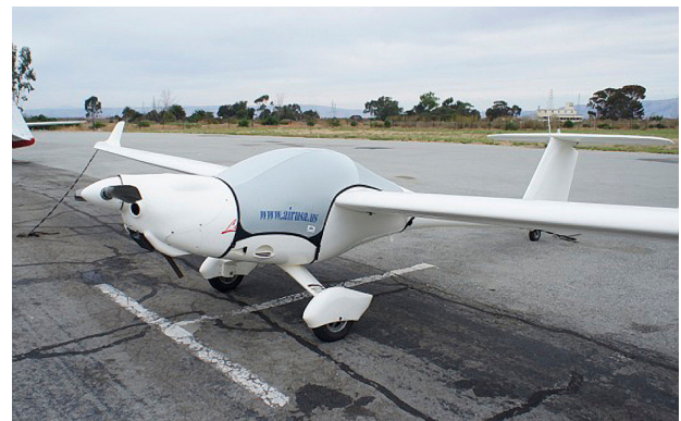
Lambda Canopy Cover