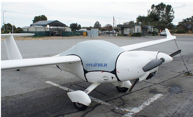
Lambada Travel Canopy Cover