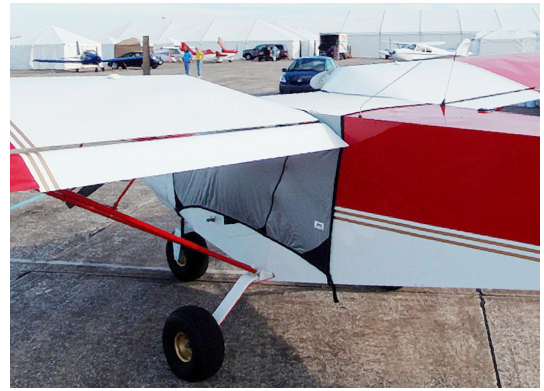
Zenith 701 Spandex FlyAway Travel Canopy Cover