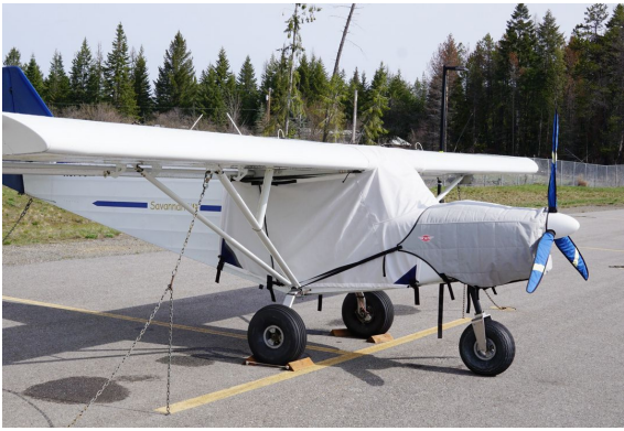
Savannah VG Canopy Cover, Insulated Engine Cover