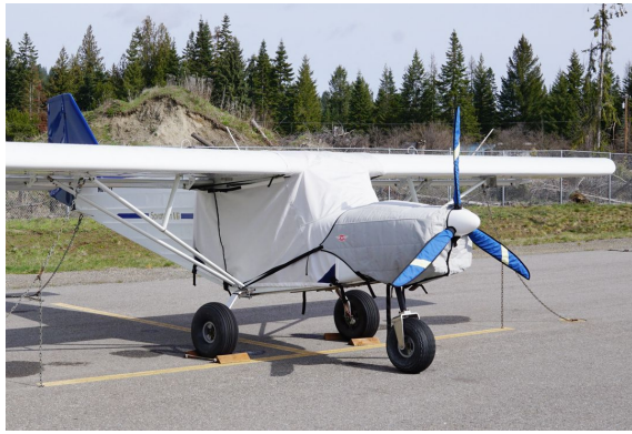
Savannah VG & S Models Canopy Cover, Over Top Type