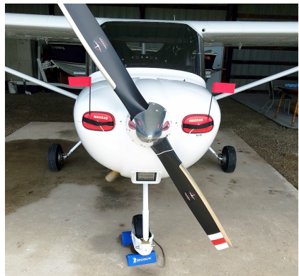
Cessna Skycatcher 162 Engine Inlet Plugs