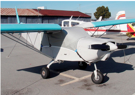
Zenith 801 Standard Canopy Cover

This cover type is made from Silver Acrylic Sunbrella canvas and is 100% lined with a soft and smooth microfiber. Bruce's Custom Covers developed this material combination especially for aircraft protection. The outer material is medium weight and treated for water resistance, UV resistance and anti-static buildup. The inner lining is a very soft and smooth microfiber to prevent scratching. The material is very reflective, and tests show that the cabin interior temperature can be reduced to near-ambient temperature on the hottest of days. It is water, ice and snow repellent, yet breathable to allow moisture to escape from between the cover and the aircraft surface.