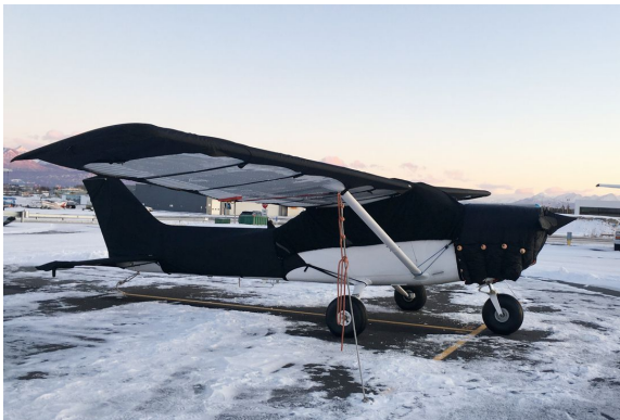
Cessna 172 Canopy, Engine, Prop, Wing & Empennage Covers