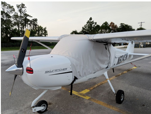
Cessna Skycatcher 162 Canopy Cover and Engine Inlet Plugs

Engine Inlet Plugs are custom fit for your Savannah VG & S Models intakes, made with heavy-duty vinyl material, and stuffed with a single block of sculpted urethane foam. Each plug has a zipper that allows the foam to be removed and dried if necessary. Engine plugs have warning flags that are visible from the cockpit or 'remove before flight' streamers sewn onto the face of the plugs. Most plugs are imprinted with the aircraft registration number in black for an extra charge. Storage bag NOT included. Engine plugs may be inserted after flight when the engine is still warm. Engine Inlet Plugs are commonly referred to as Cowl Plugs, Intake Plugs, Cowl Blocks, Engine Blocks, and Engine Bungs.