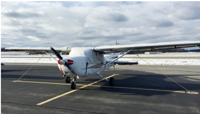
Cessna 172 Engine Plugs and Canopy, Wing, Horizontal Stabilizer Covers

WINTER USE MATERIAL - Made with Solution-Dyed Polyester fabric, this option is intended for seasonal use to aid in deicing, rain mitigation, or for occasional travel. The material is lighter and more compact, but more susceptible to UV damage and may have a shorter useful life if used continuously outside than the all-year use material.