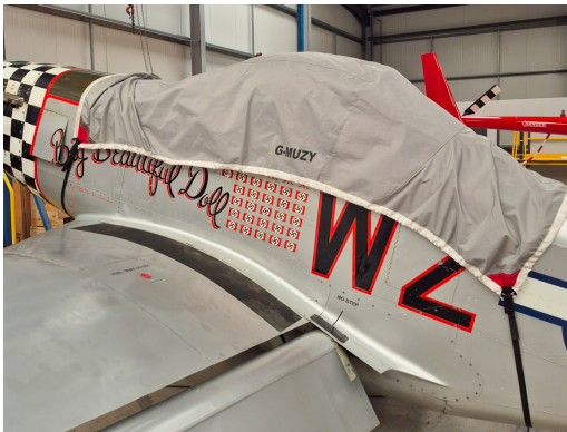
ScaleWings SW-51 Mustang Canopy Cover

the hottest of days. It is water, ice and snow repellent, yet breathable to allow moisture to escape from between the cover and the aircraft surface.