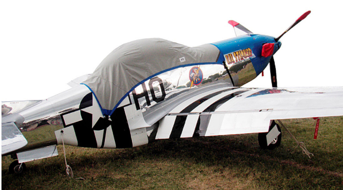
Stewart Mustang Canopy Cover, Prop Tie Downs & Intake Plugs