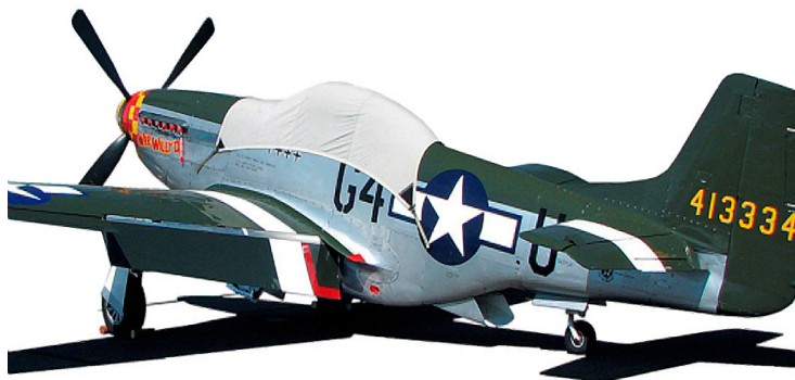
North American P51 Canopy Cover & Exhaust Plugs