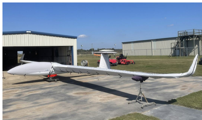
Pdzs Pzl-Bielsko SZD-48-3 Cover Set