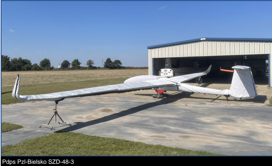
Pdps Pzl-Bielsko SZD-48-3