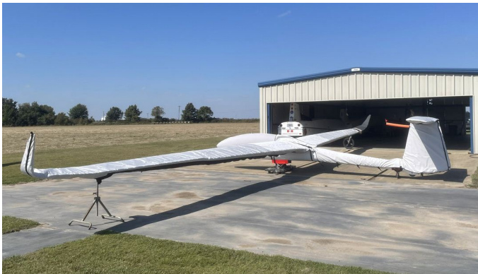
Pdps Pzl-Bielsko SZD-48-3