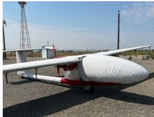
SZD-45 Ogar Canopy/Nose, Wings & Empennage Covers