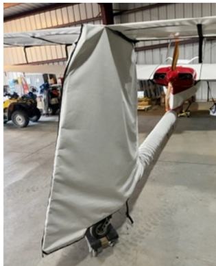
SZD-45 Ogar Empennage Cover

WINTER USE MATERIAL - Made with Solution-Dyed Polyester fabric, this option is intended for seasonal use to aid in deicing, rain mitigation, or for occasional travel. The material is lighter and more compact, but more susceptible to UV damage and may have a shorter useful life if used continuously outside than the all-year use material.