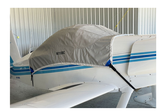
T-18 Travel Cover, Light Weight Canopy Cover (Bubble Canopy)

Travel Covers are made with Silver Solution-Dyed Polyester fabric and only lined over the windshield to save weight. The material is lightweight and more compact for easy stowage in the aircraft. The polyester material is water resistant, but only intended for occasional use outside. We also have an ultra lightweight material available for fitted hangar dust covers. For daily outdoor use, the non-travel Sunbrella Cover is the best choice.