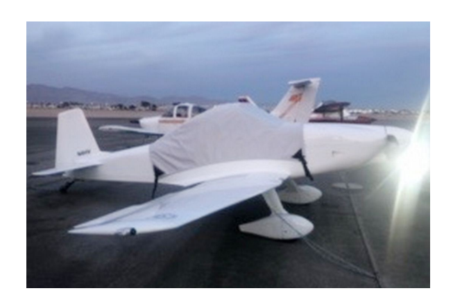
Bushby Mustang Complete Fuselage Cover with Detachable Wing Covers