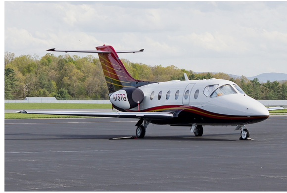
Nextant 400XTi Cockpit HeatShields, Bikini Type Engine Covers