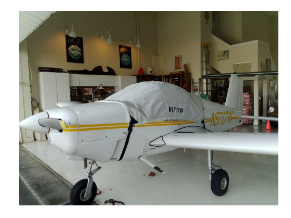
Thorp Sky Scooter T211 Canopy Cover

This cover type is made from Silver Acrylic Sunbrella canvas and is 100% lined with a soft and smooth microfiber. Bruce's Custom Covers developed this material combination especially for aircraft protection. The outer material is medium weight and treated for water resistance, UV resistance and anti-static buildup. The inner lining is a very soft and smooth microfiber to prevent scratching. The material is very reflective, and tests show that the cabin interior temperature can be reduced to near-ambient temperature on the hottest of days. It is water, ice and snow repellent, yet breathable to allow moisture to escape from between the cover and the aircraft surface.