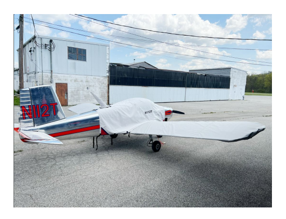
Thorp Sky Scooter Extended Canopy Cover & Wing Covers