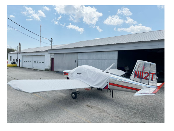
Thorp Sky Scooter Extended Canopy Cover & Wing Covers