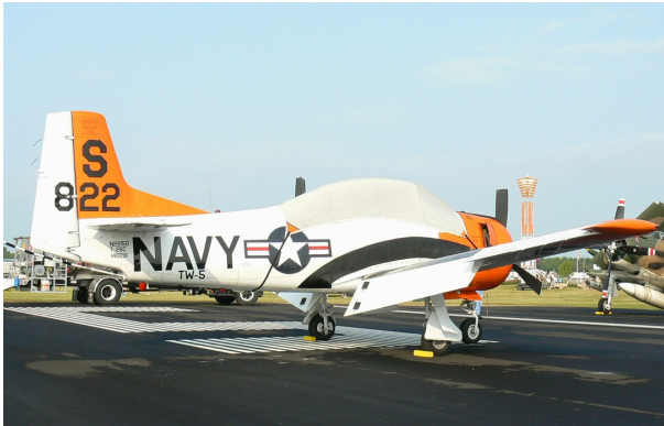
North American T-28 Canopy Cover

Travel Covers are made with Silver Solution-Dyed Polyester fabric and only lined over the windshield to save weight. The material is lightweight and more compact for easy stowage in the aircraft. The polyester material is water resistant, but only intended for occasional use outside. We also have an ultra lightweight material available for fitted hangar dust covers. For daily outdoor use, the non-travel Sunbrella Cover is the best choice.