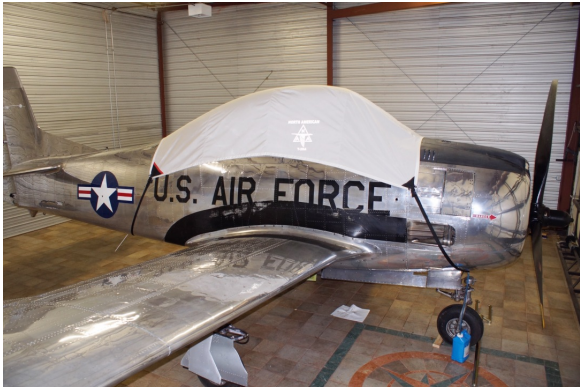
North American T-28 Canopy Cover