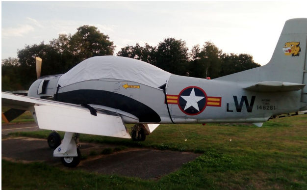
1957 North American T28C Canopy Cover