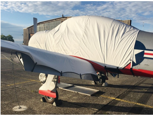
North American T28 Extended Canopy Cover