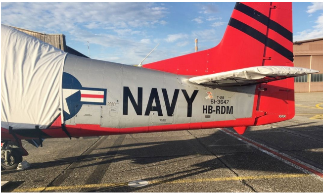
North American T28 Extended Canopy CoverT28 Horizontal Stabilizer Covers

WINTER USE MATERIAL - Made with Solution-Dyed Polyester fabric, this option is intended for seasonal use to aid in deicing, rain mitigation, or for occasional travel. The material is lighter and more compact, but more susceptible to UV damage and may have a shorter useful life if used continuously outside than the all-year use material.