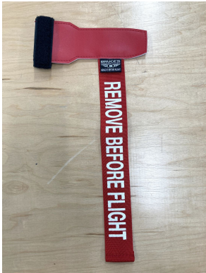
Pitot Tube Cover

plugs have warning flags that are visible from the cockpit or 'remove before flight' streamers sewn onto the face of the plugs. Most plugs are imprinted with the aircraft registration number in black for an extra charge. Storage bag NOT included. Engine plugs may be inserted after flight when the engine is still warm. Engine Inlet Plugs are commonly referred to as Cowl Plugs, Intake Plugs, Cowl Blocks, Engine Blocks, and Engine Bungs.