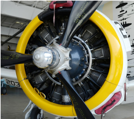
North American T28 Trojan Carb. Air Inlet Plug