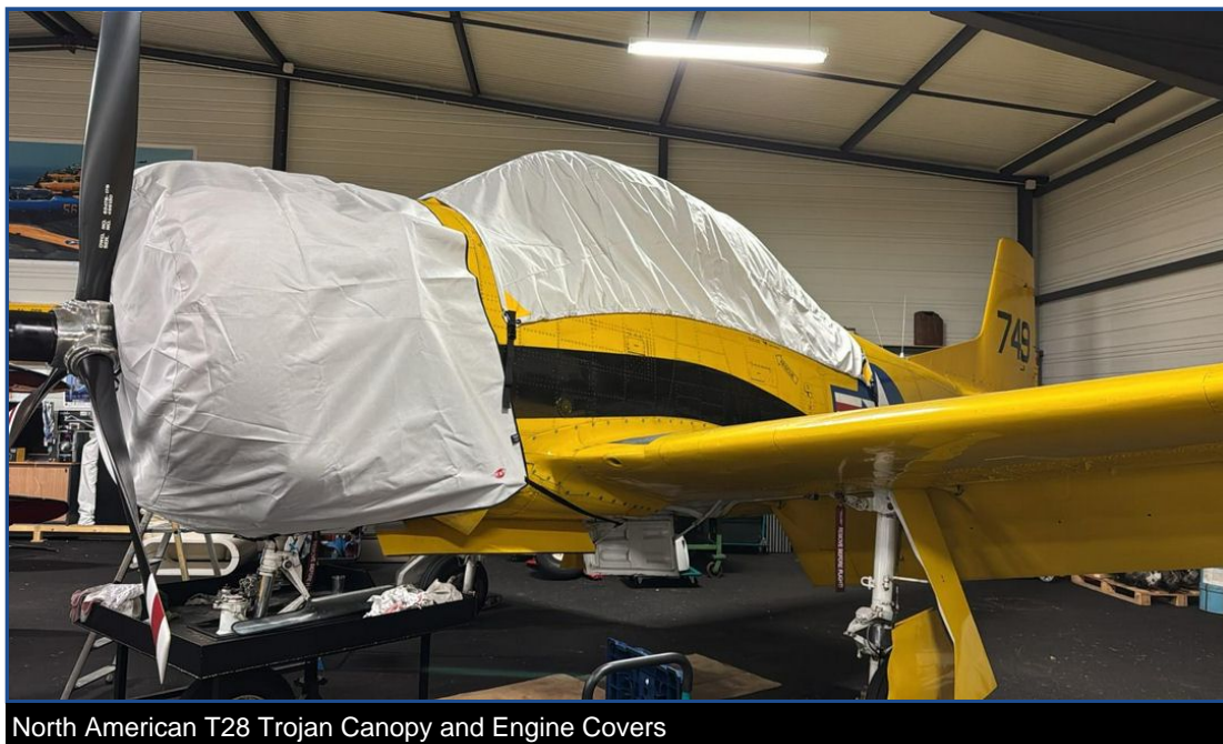
North American T28 Trojan Canopy and Engine Covers