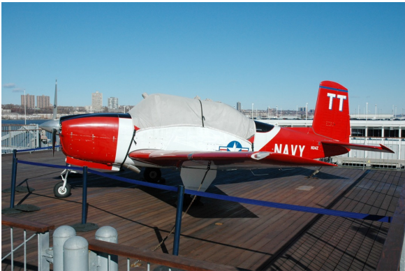
Beech T34 Canopy Cover