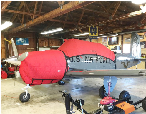
Beech T34 Mentor Canopy Cover, Insulated Engine Cover

This cover type is made from Silver Acrylic Sunbrella canvas and is 100% lined with a soft and smooth microfiber. Bruce's Custom Covers developed this material combination especially for aircraft protection. The outer material is medium weight and treated for water resistance, UV resistance and anti-static buildup. The inner lining is a very soft and smooth microfiber to prevent scratching. The material is very reflective, and tests show that the cabin interior temperature can be reduced to near-ambient temperature on the hottest of days. It is water, ice and snow repellent, yet breathable to allow moisture to escape from between the cover and the aircraft surface.