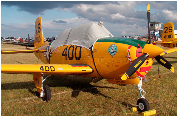
T34 Canopy Cover & Engine Inlet Plugs