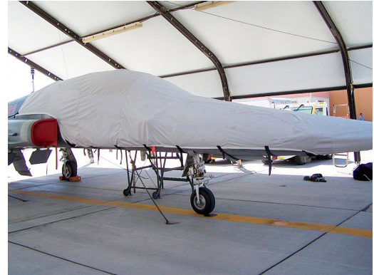
Northup F5 Talon Canopy Cover