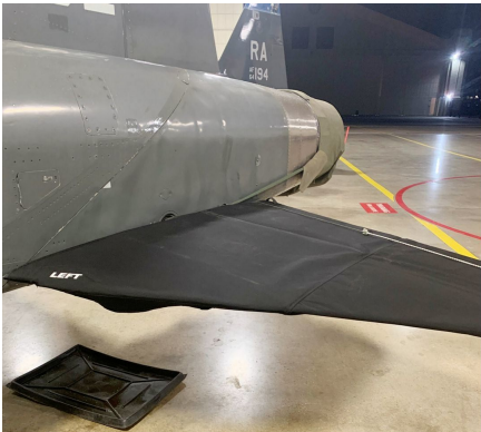
Northrop T-38 Horizontal Stabilizer Cover

WINTER USE MATERIAL - Made with Solution-Dyed Polyester fabric, this option is intended for seasonal use to aid in deicing, rain mitigation, or for occasional travel. The material is lighter and more compact, but more susceptible to UV damage and may have a shorter useful life if used continuously outside than the all-year use material.