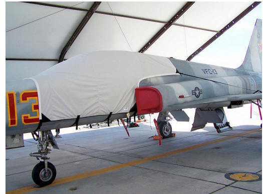
Northup F5 Talon Canopy Cover