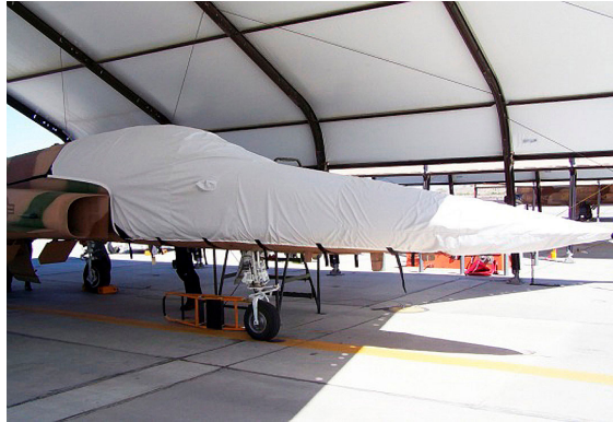
Northup F-5 Talon Canopy/Nose Cover

This cover type is made from Silver Acrylic Sunbrella canvas and is 100% lined with a soft and smooth microfiber. Bruce's Custom Covers developed this material combination especially for aircraft protection. The outer material is medium weight and treated for water resistance, UV resistance and anti-static buildup. The inner lining is a very soft and smooth microfiber to prevent scratching. The material is very reflective, and tests show that the cabin interior temperature can be reduced to near-ambient temperature on the hottest of days. It is water, ice and snow repellent, yet breathable to allow moisture to escape from between the cover and the aircraft surface.