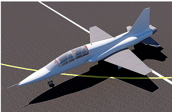
T-38 Talon Wing and Horizontal Stabilizer Covers (3D Rendering)

WINTER USE MATERIAL - Made with Solution-Dyed Polyester fabric, this option is intended for seasonal use to aid in deicing, rain mitigation, or for occasional travel. The material is lighter and more compact, but more susceptible to UV damage and may have a shorter useful life if used continuously outside than the all-year use material.