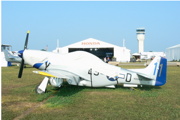
Thunder Mustang Canopy & Engine Cover

This cover type is made from Silver Acrylic Sunbrella canvas and is 100% lined with a soft and smooth microfiber. Bruce's Custom Covers developed this material combination especially for aircraft protection. The outer material is medium weight and treated for water resistance, UV resistance and anti-static buildup. The inner lining is a very soft and smooth microfiber to prevent scratching. The material is very reflective, and tests show that the cabin interior temperature can be reduced to near-ambient temperature on the hottest of days. It is water, ice and snow repellent, yet breathable to allow moisture to escape from between the cover and the aircraft surface.