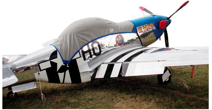
Stewart Mustang Canopy Cover, Prop Tie Downs & Intake Plugs Stewart Mustang Canopy Cover, Prop Tie Downs & Intake Plugs