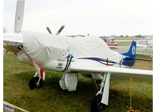
Thunder Mustang Canopy & Engine Cover