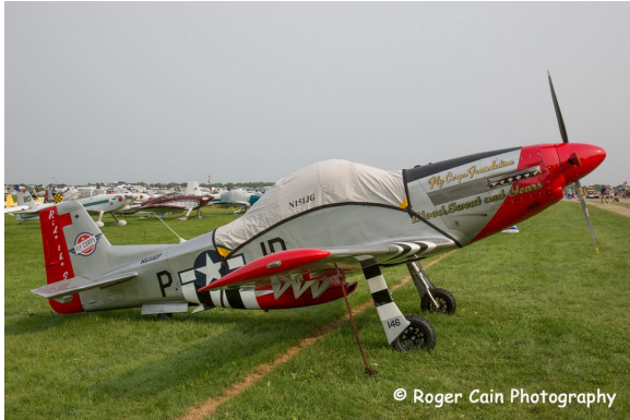
Titan Mustang Canopy Cover

This cover type is made from Silver Acrylic Sunbrella canvas and is 100% lined with a soft and smooth microfiber. Bruce's Custom Covers developed this material combination especially for aircraft protection. The outer material is medium weight and treated for water resistance, UV resistance and anti-static buildup. The inner lining is a very soft and smooth microfiber to prevent scratching. The material is very reflective, and tests show that the cabin interior temperature can be reduced to near-ambient temperature on the hottest of days. It is water, ice and snow repellent, yet breathable to allow moisture to escape from between the cover and the aircraft surface.