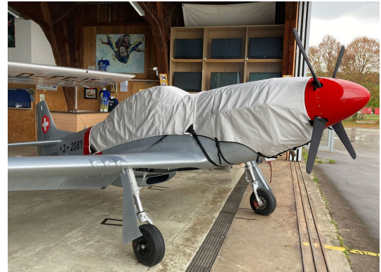
SW-51 Mustang Canopy & Engine Covers