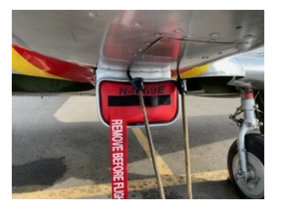
North American T6 Chin Scoop Plug

Engine Inlet Plugs are custom fit for your North American T6, SNJ, Harvard intakes, made with heavy-duty vinyl material, and stuffed with a single block of sculpted urethane foam. Each plug has a zipper that allows the foam to be removed and dried if necessary. Engine plugs have warning flags that are visible from the cockpit or 'remove before flight' streamers sewn onto the face of the plugs. Most plugs are imprinted with the aircraft registration number in black for an extra charge. Storage bag NOT included. Engine plugs may be inserted after flight when the engine is still warm. Engine Inlet Plugs are commonly referred to as Cowl Plugs, Intake Plugs, Cowl Blocks, Engine Blocks, and Engine Bungs.