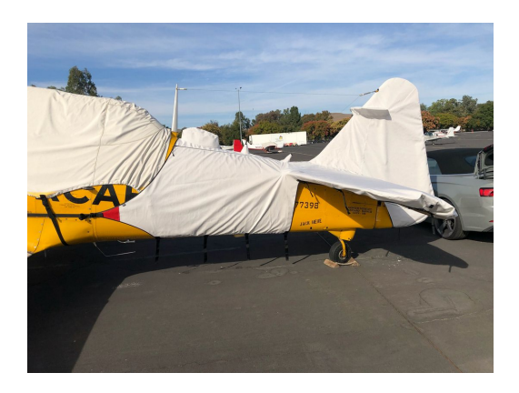
North American T6 Empennage Cover

WINTER USE MATERIAL - Made with Solution-Dyed Polyester fabric, this option is intended for seasonal use to aid in deicing, rain mitigation, or for occasional travel. The material is lighter and more compact, but more susceptible to UV damage and may have a shorter useful life if used continuously outside than the all-year use material.