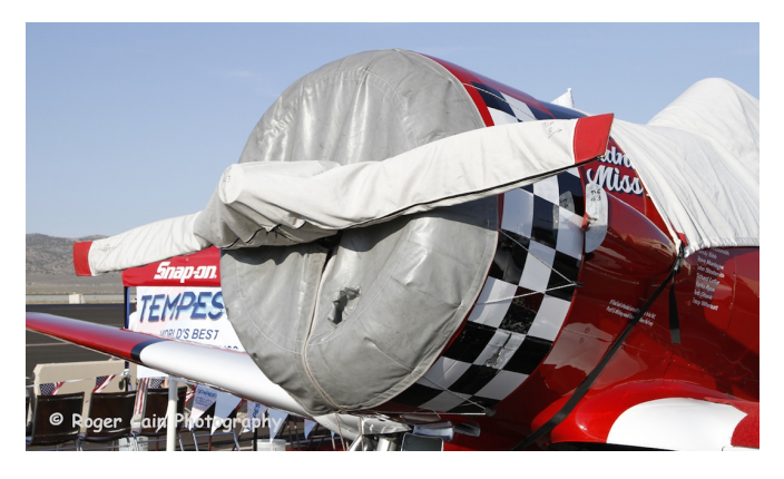
North American T6 Propellor Cover

This cover type is made from Silver Acrylic Sunbrella canvas and is 100% lined with a soft and smooth microfiber. Bruce's Custom Covers developed this material combination especially for aircraft protection. The outer material is medium weight and treated for water resistance, UV resistance and anti-static buildup. The inner lining is a very soft and smooth microfiber to prevent scratching. The material is very reflective, and tests show that the cabin interior temperature can be reduced to near-ambient temperature on the hottest of days. It is water, ice and snow repellent, yet breathable to allow moisture to escape from between the cover and the aircraft surface.