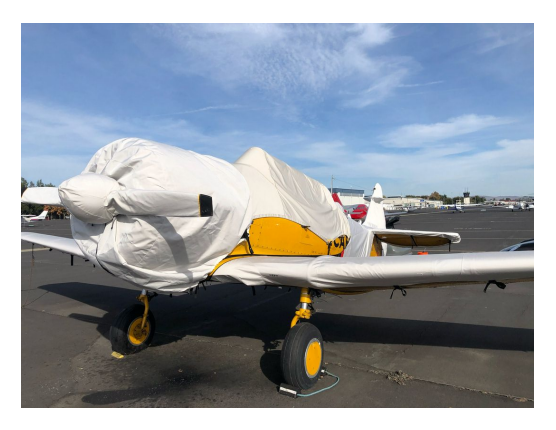
North American T6 Prop, Engine & Wing Covers