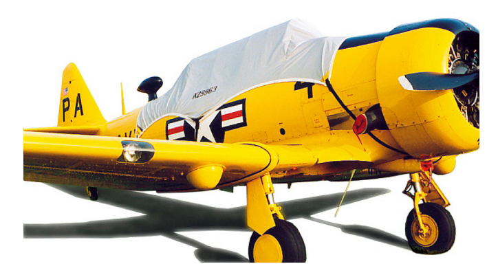
North American T6 Canopy Cover w/30" fwd ext, Exhaust Plugs

Travel Covers are made with Silver Solution-Dyed Polyester fabric and only lined over the windshield to save weight. The material is lightweight and more compact for easy stowage in the aircraft. The polyester material is water resistant, but only intended for occasional use outside. We also have an ultra lightweight material available for fitted hangar dust covers. For daily outdoor use, the non-travel Sunbrella Cover is the best choice.