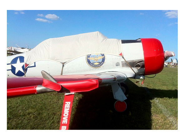
T6 Pitot, Canopy & Prop Covers