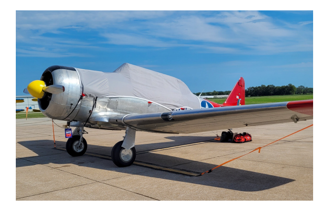
North American T6 Travel Cover, Light Weight Canopy Cover with 50" fwd ext