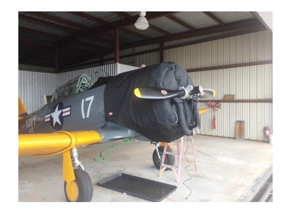
North American SNJ-4 Insulated Engine Cover with Aerotherm Preheater Access Flaps