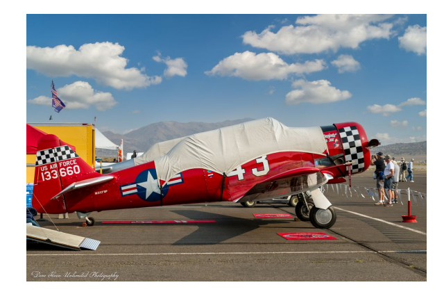
North American T6 Canopy Cover

North American T6 Pitot cover (straight bayonet type)