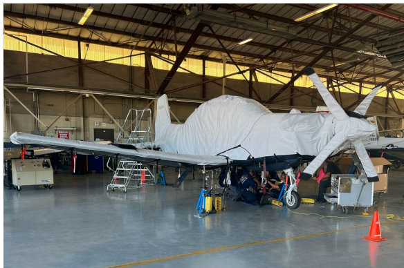
Beech T-6A Texan 2 Complete Hail Protection Cover Set

This cover type is made from Silver Acrylic Sunbrella canvas and is 100% lined with a soft and smooth microfiber. Bruce's Custom Covers developed this material combination especially for aircraft protection. The outer material is medium weight and treated for water resistance, UV resistance and anti-static buildup. The inner lining is a very soft and smooth microfiber to prevent scratching. The material is very reflective, and tests show that the cabin interior temperature can be reduced to near-ambient temperature on the hottest of days. It is water, ice and snow repellent, yet breathable to allow moisture to escape from between the cover and the aircraft surface.