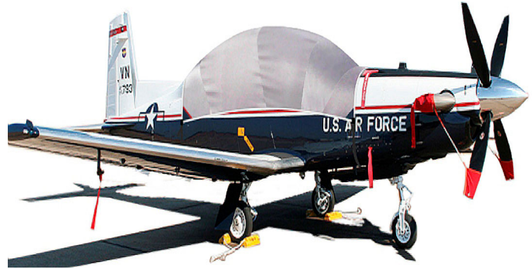
Beech T-6A Texan 2 Complete Hail Protection Cover Set